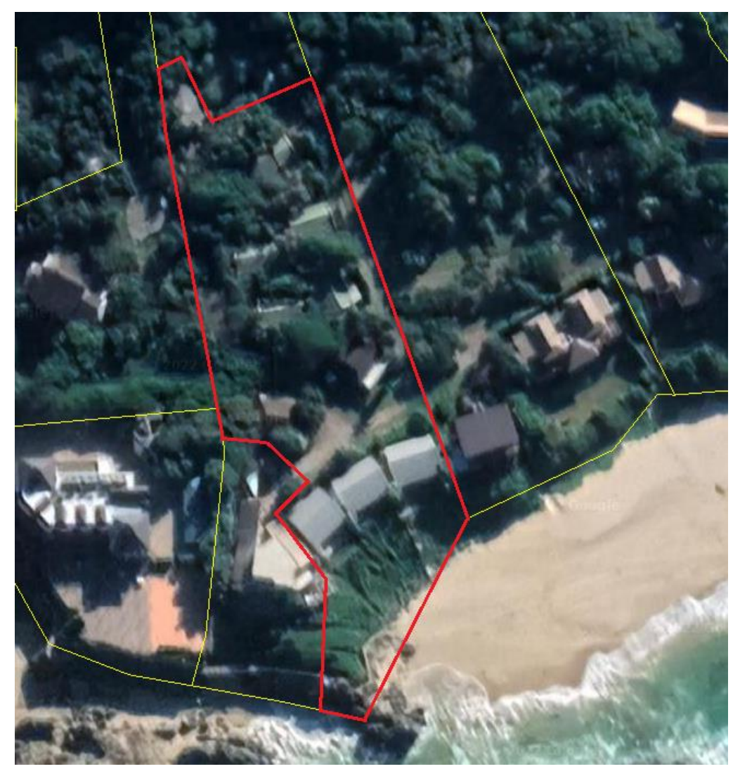
Fig. 1: The cadastral boundary of the property (outlined in red) investigated during the site survey. The site visit consisted of visual and acoustic surveys throughout the demarcated area.