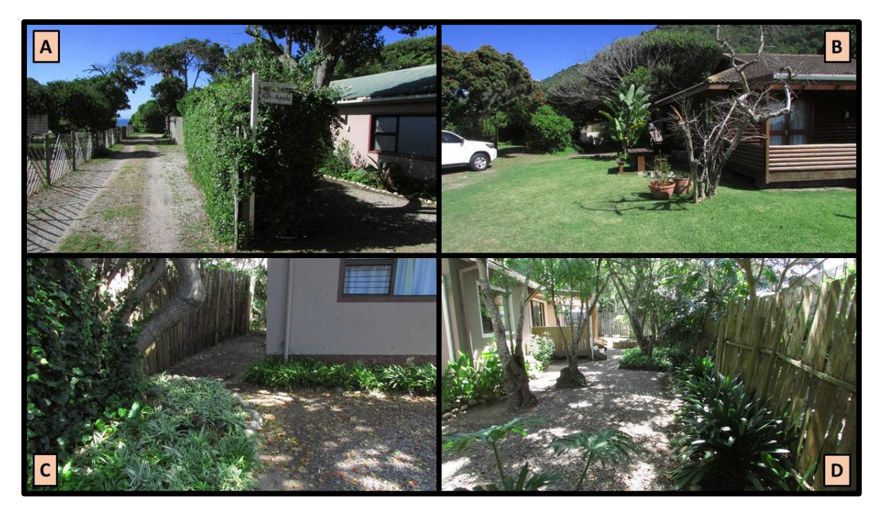
Fig. 2: The typical habitats present at the study site, with (A) open, disturbed pathways; (B) open, short lawns with scattered planted trees; and (C & D) garden beds alongside the current accommodation, under a canopy of medium height trees.