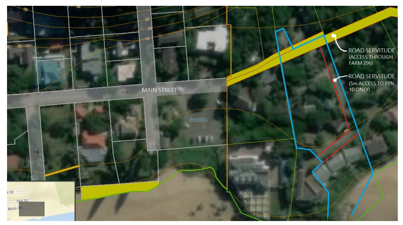
Figure 2 - Roads and access