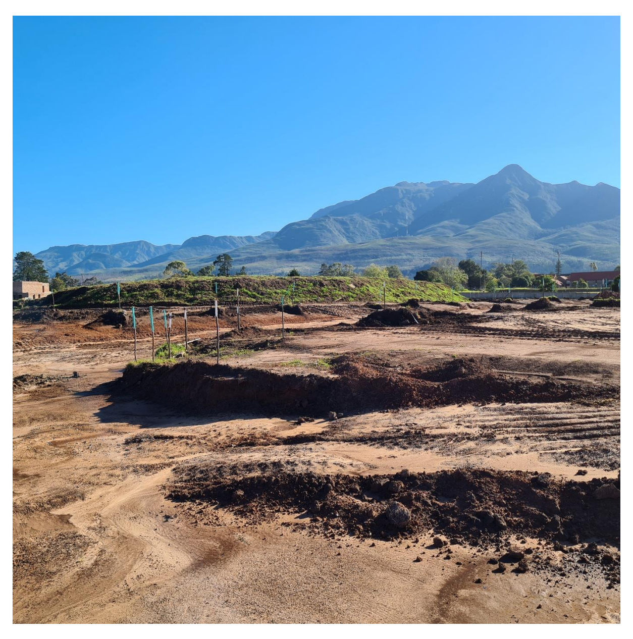
Figure 5: Pegged platforms visible along with top soil stockpiles in the background.