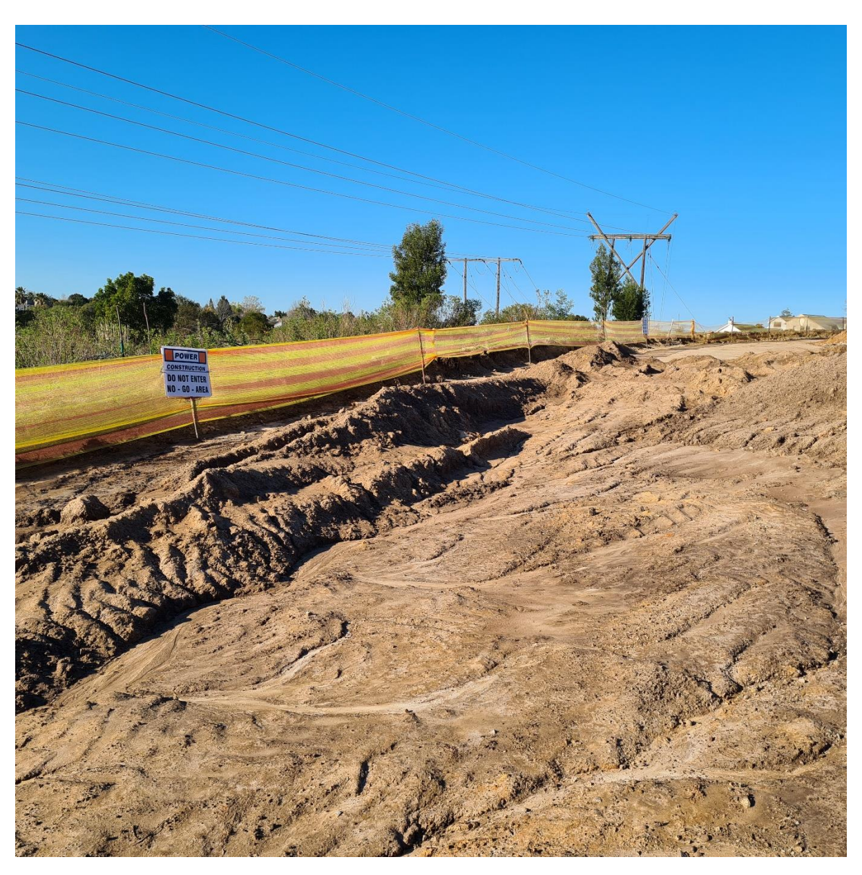
Figure 3: Demarcated area along Camphersdrift system outside the existing overhead powerlines that runs along the Camphersdrift system.