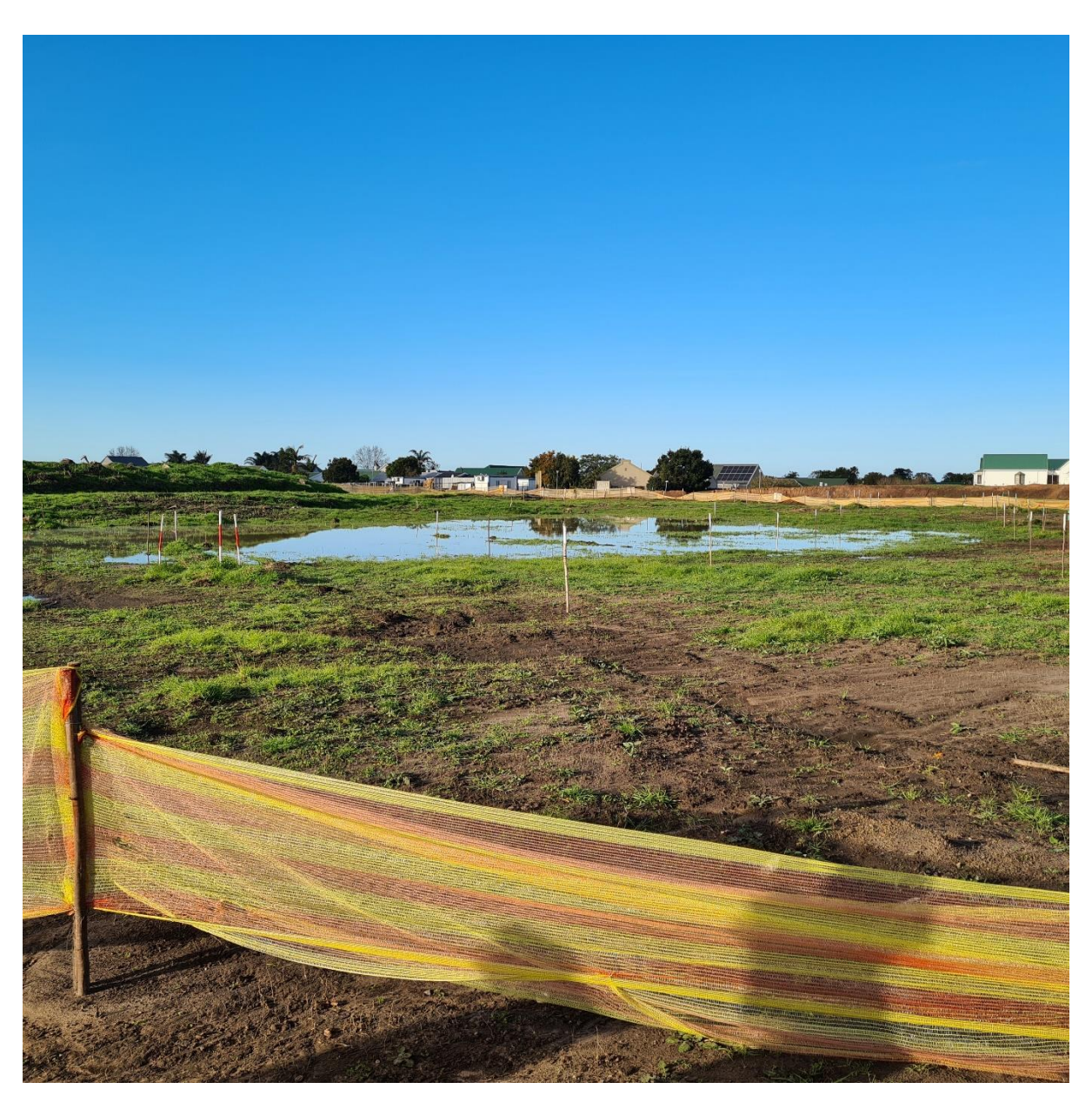
Figure 2: Demarcated on-site wetland with partial ground cover.