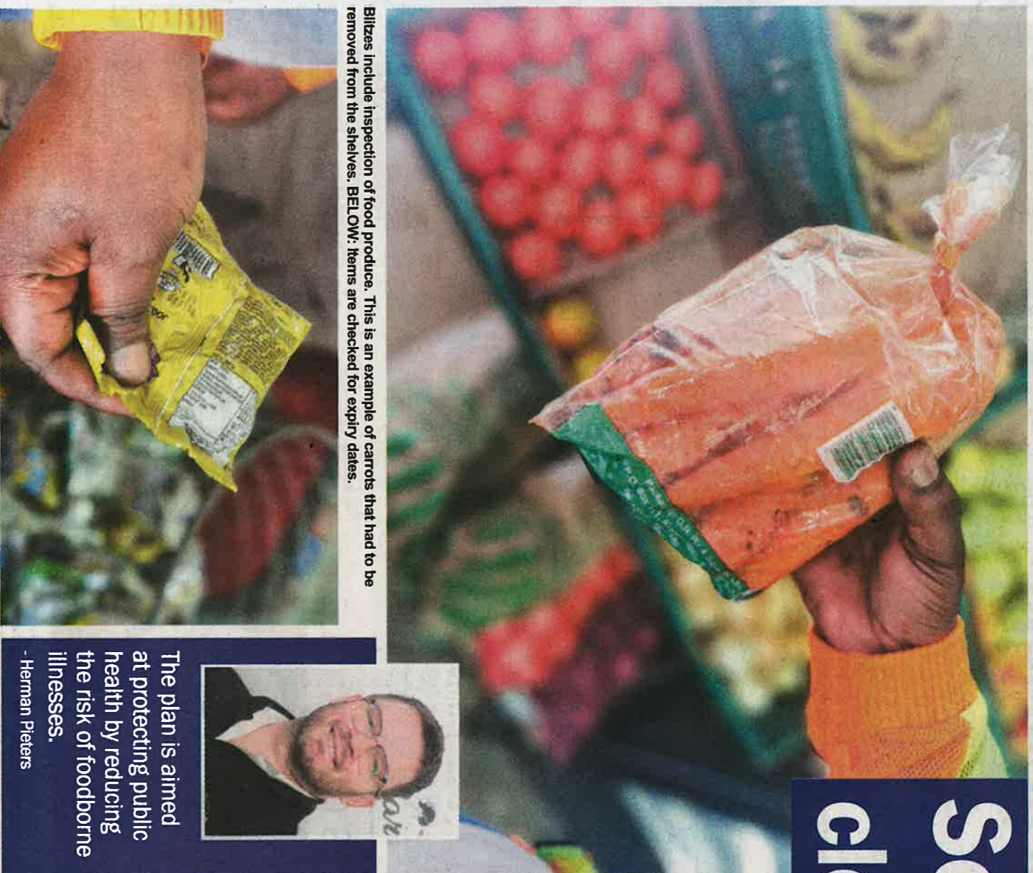
Blitzes include inspection of food produce. This is an example of carrots that had to be removed from the shelves. BELOW: Items are checked for expiry dates.