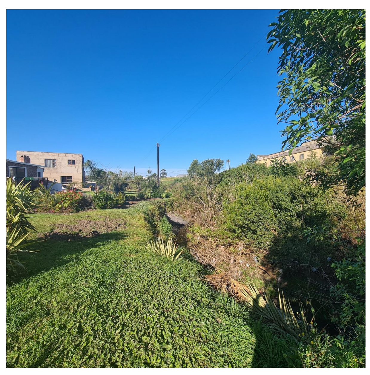
Figure 1: Mowed lawn on river embankment (Kikuyu grass).