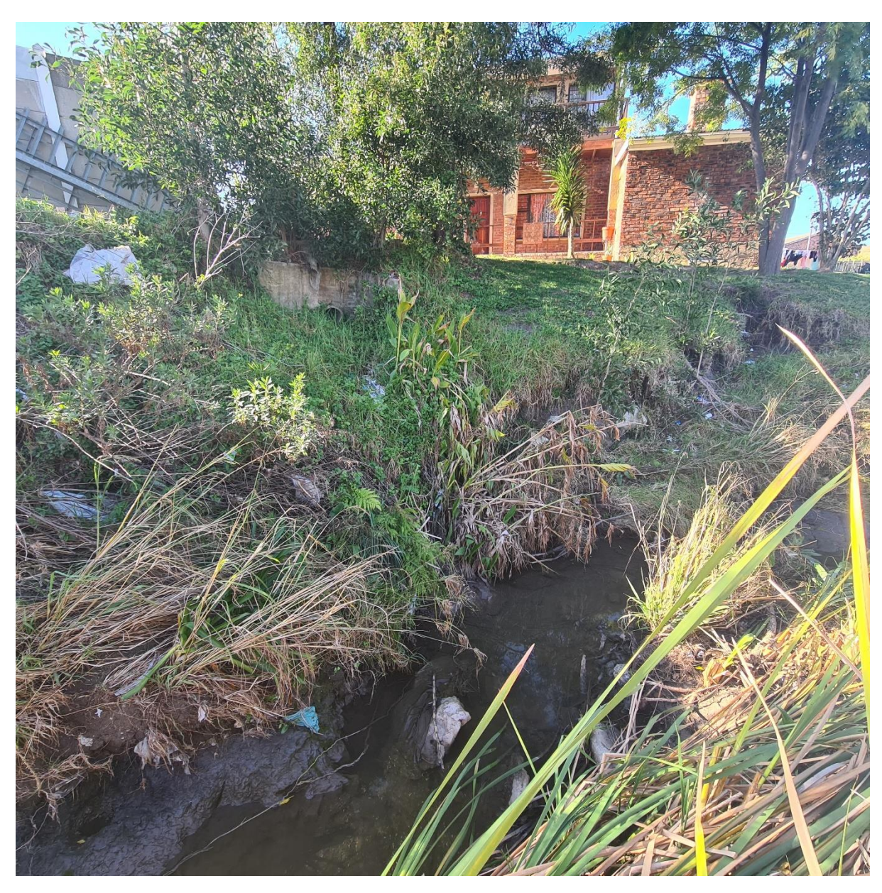
Figure 5: Area of main concern.