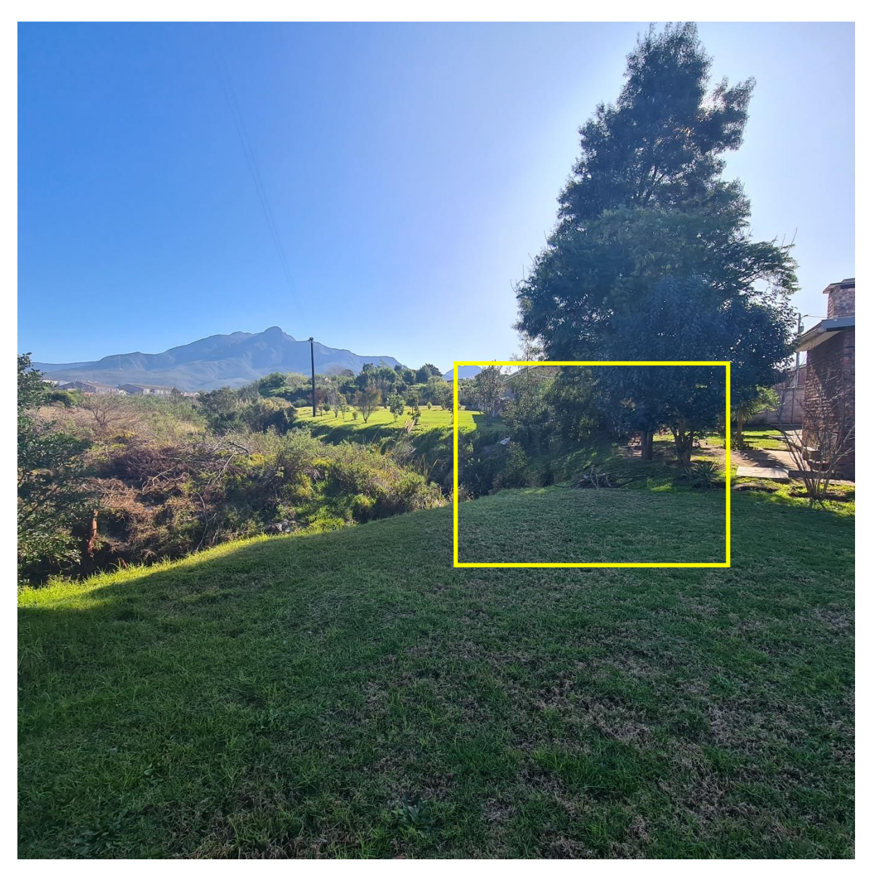
Figure 3: Main problem area along Erf 21150 & 21151.