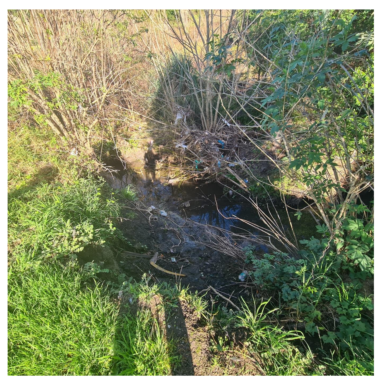
Figure 6: Degraded watercourse full of rubble.