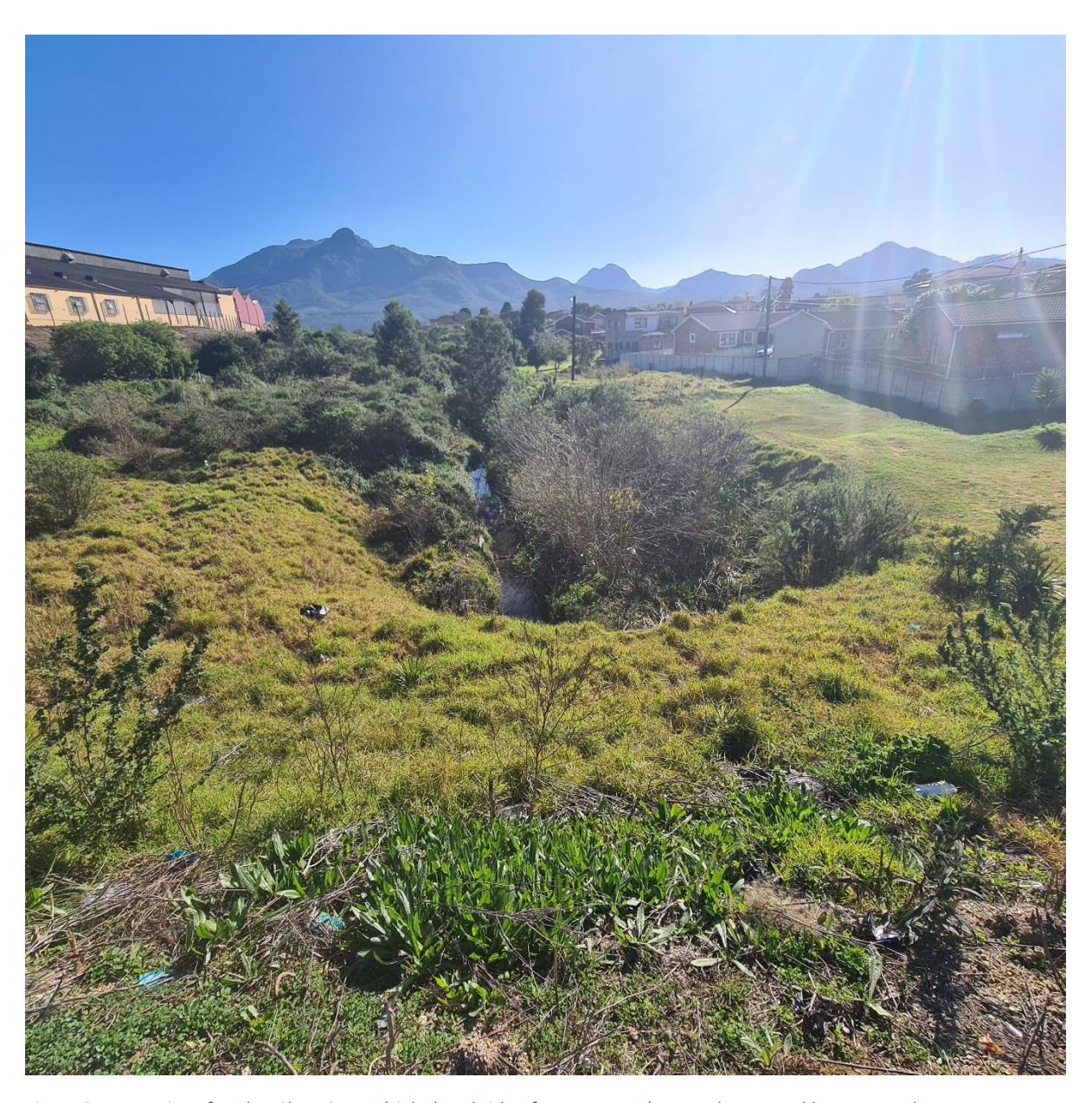
Figure 2: Properties of Molen Close Street (right hand side of watercourse). Note the mowed lawn up to the watercourse.