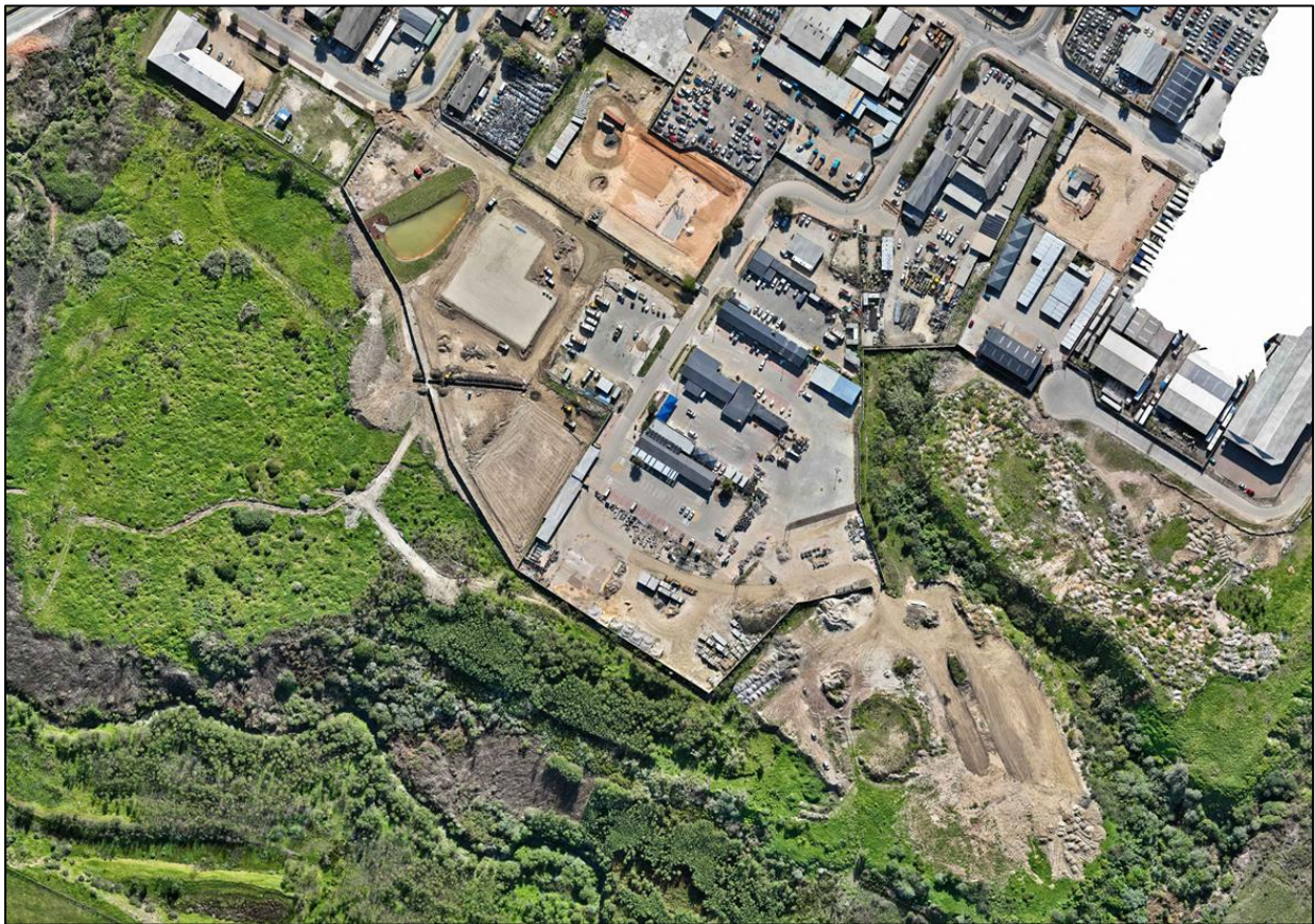
Figure 2: Aerial imagery of the subject portion of Erf 464 providing evidence of construction activities undertaken without prior Environmental Authorisation for proposed improvement infrastructure to the George Municipality's Civil Engineering Services Depot.

George Municipality's Civil Engineering Services Depot is located on a portion of Erf 464. Existing buildings on the subject portion of Erf 464, amounts to a total coverage of approximately 6067m 2 with an additional 1809m 2 currently under construction.