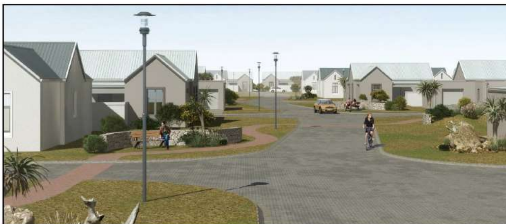
Figure 3: Artist impression of the proposed lifestyle village.