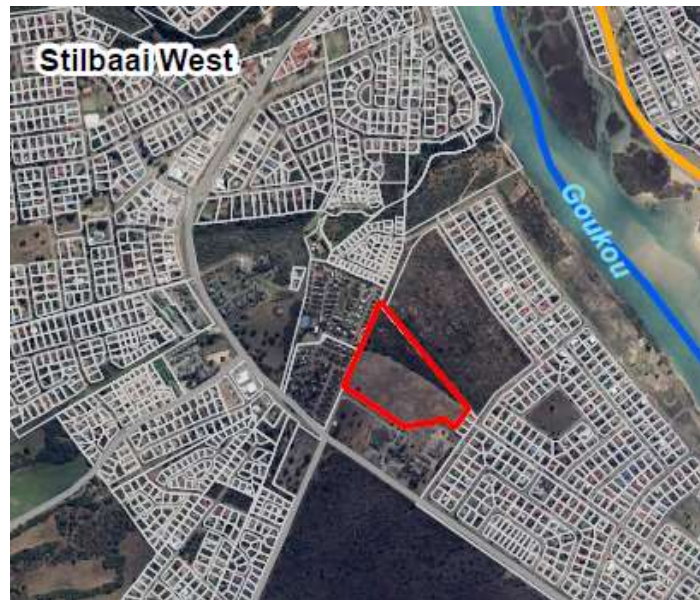
Figure 1: Location of property next to Palinggat Resort and Municipal offices/SAPS.

Erf 4784 (a portion of Erf 657 – not registered yet) is owned by the Hessequa Municipality. The property was alienated through a process dating back to 2015 when the most suitable land use was considered (retirement use), followed by a tender process in which Ellenrust Properties (Pty) Ltd was awarded the tender.