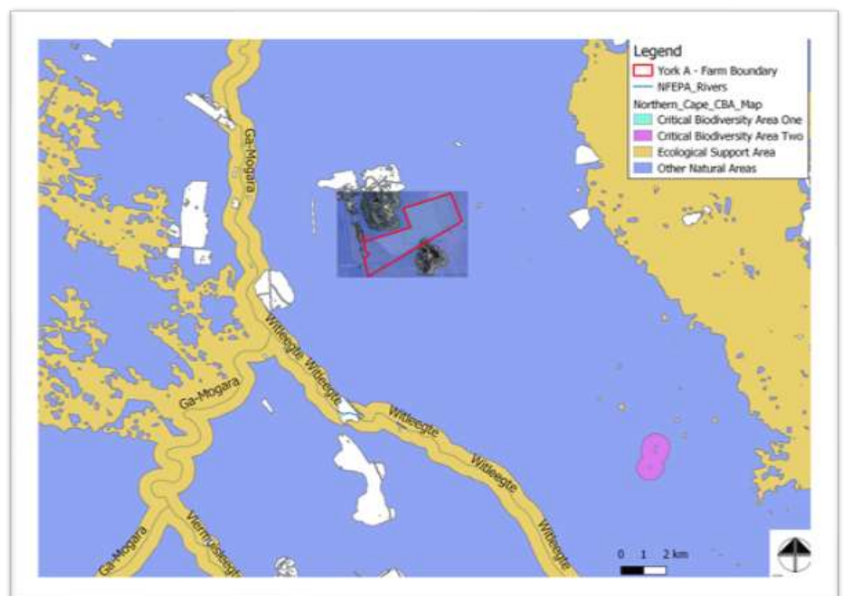
Figure 3: The property in relation to Northern Cape Critical Biodiversity Areas (Holness & Oosthuysen, 2016).

The following figure indicates the Northern Cape Critical Biodiversity Areas, which substantiates that no aquatic related areas are associated with the study area.