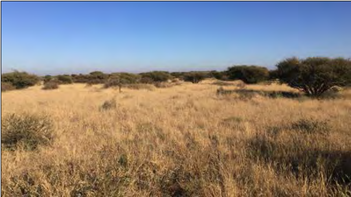
Figure 5: View west from Photo 4 of a similar bushveld vegetation.