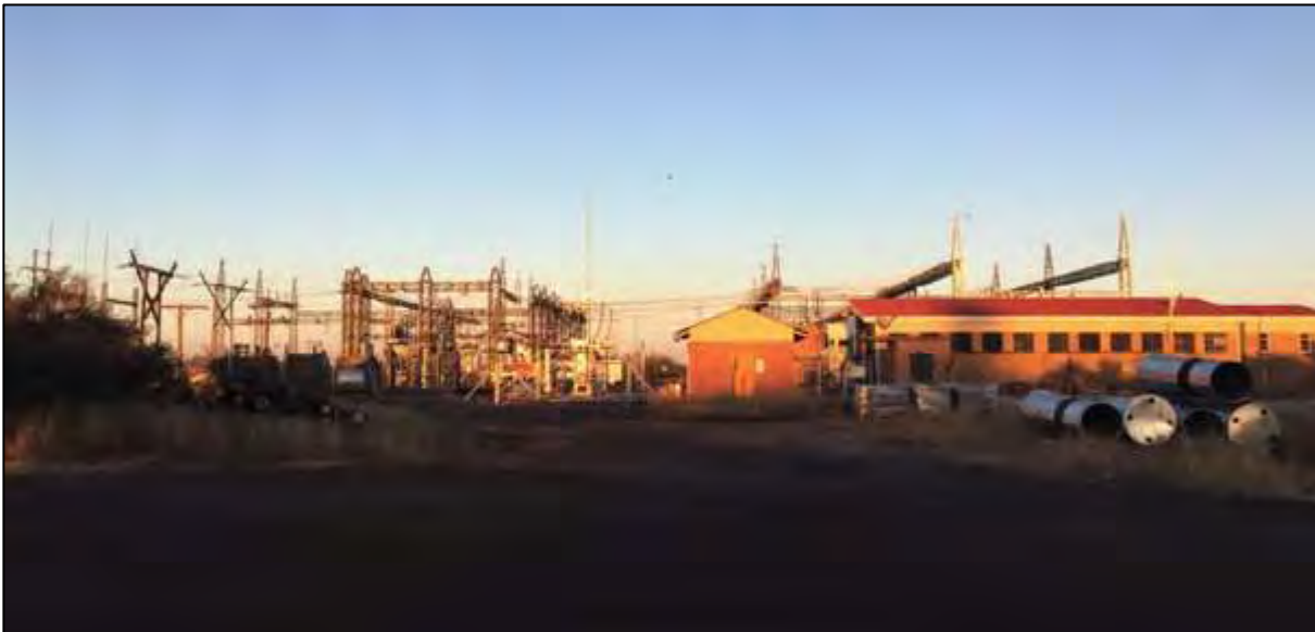
Figure 7: View west from Photo 6 of the existing Hotazel Substation to which the proposed power line would be routed.