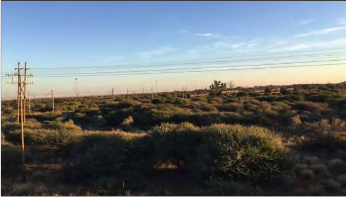
Figure 6: View north from Photo 5 of the existing power line and railway line infrastructure along which the proposed power line would be routed.