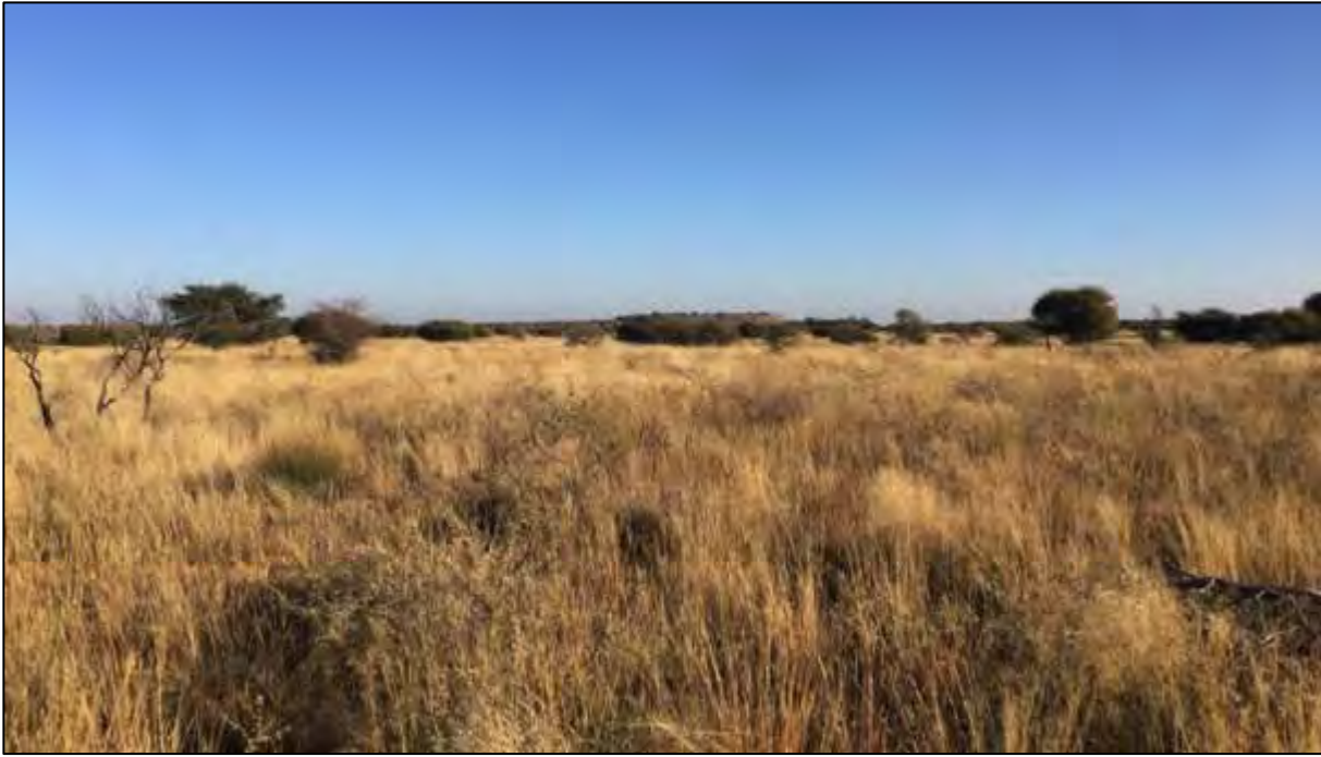
Figure 2: View north from Photo 1 of the grasslands and scattered bushveld trees with the old Hotazel Mine Waste Rock Dumps visible in the background.