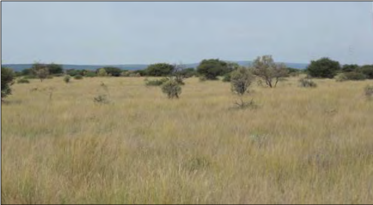
Figure 10. Example of more open veld from near the centre of the site, showing more open grassland with occasional Acacia haematoxylon and Acacia mellifera .