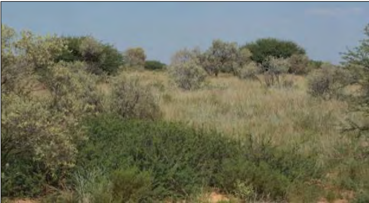
Figure 9. Typical vegetation of the site with the low Acacia hebeclada in the foreground and numerous Acacia haematoxylon throughout the area.