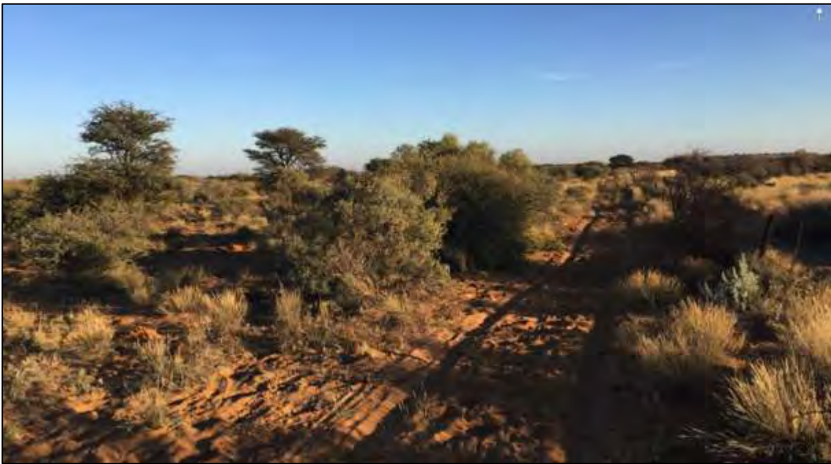
Figure 3: View north from Photo 2 of farm roads and more dense Kathu Bushveld trees.