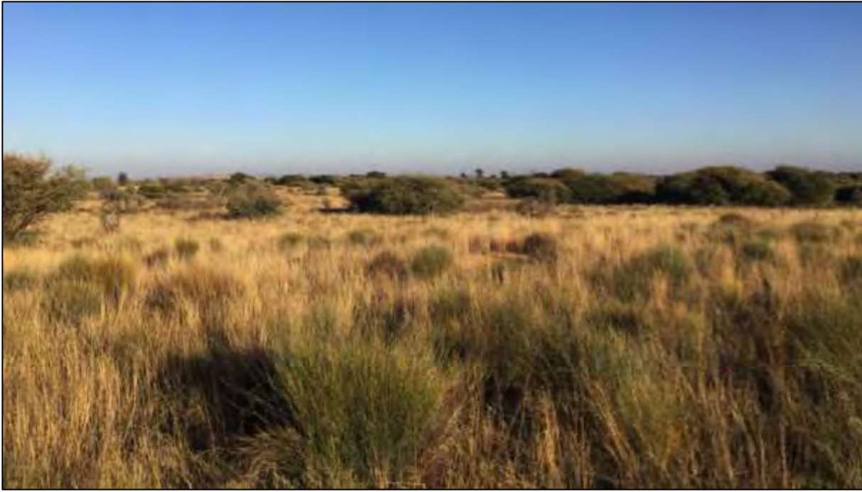
Figure 4: View north from Photo 3 of the higher bushveld vegetation.