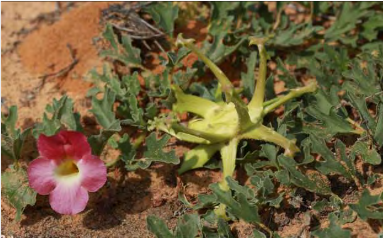
Figure 11. Devils' Claw is common at the site, especially in the west of the site.