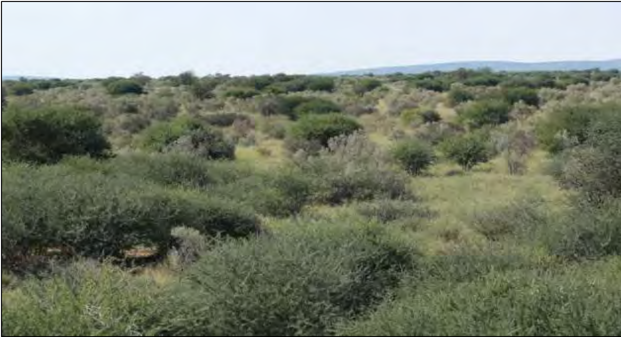
Figure 8. The western margin of the property, showing the high density of trees in this area with dense Acacia mellifera in the foreground and Acacia haematoxylon in the distance with occasional Acacia erioloba . This part of the site is not within the development footprint of Hotazel 2.