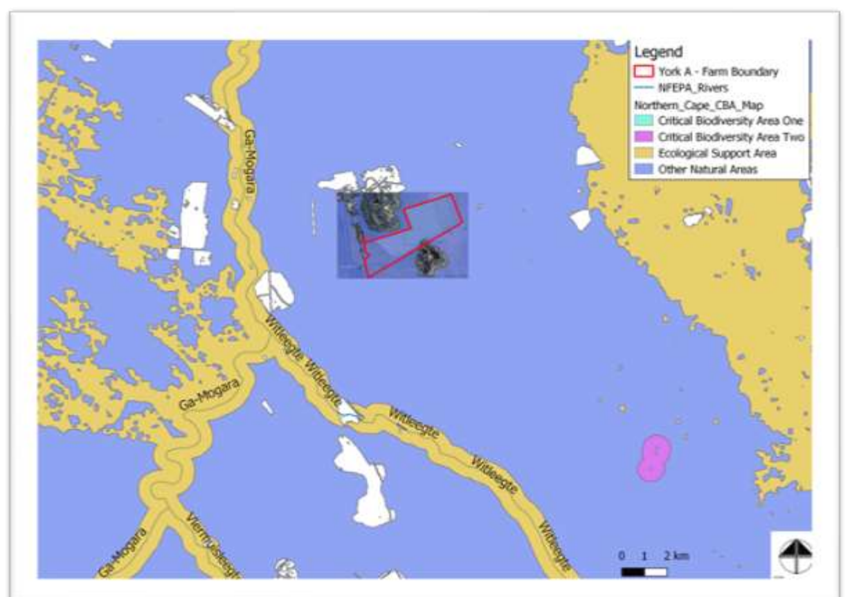
Figure 3: The property in relation to Northern Cape Critical Biodiversity Areas (Holness & Oosthuysen, 2016).

The following figure indicates the Northern Cape Critical Biodiversity Areas, which substantiates that no aquatic related areas are associated with the study area.