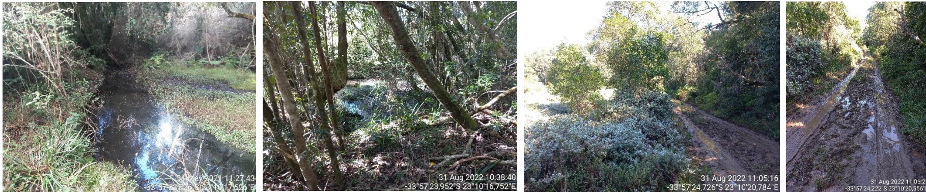
Excavated Pond / Pool on western edge of site clearing – to be avoided by development.