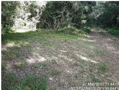
Existing clearings along access track – ideal for delivery & temporary laydown of site materials.