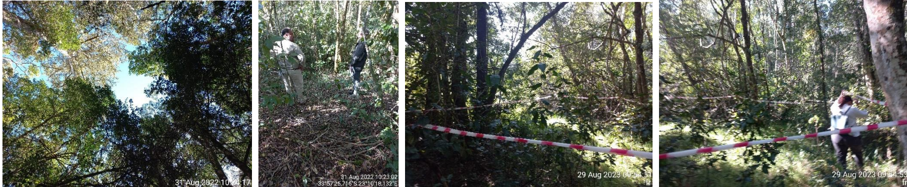
View into Forest canopy above gap in Forest. Gaps / clearings in trees in Forest fringe adjacent to existing site clearing. Demarcated by SANParks to inform final layout alternative.