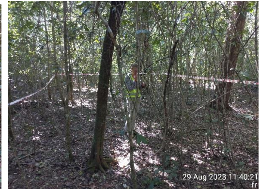
Botanical specialist walking Forest edge of clearing.