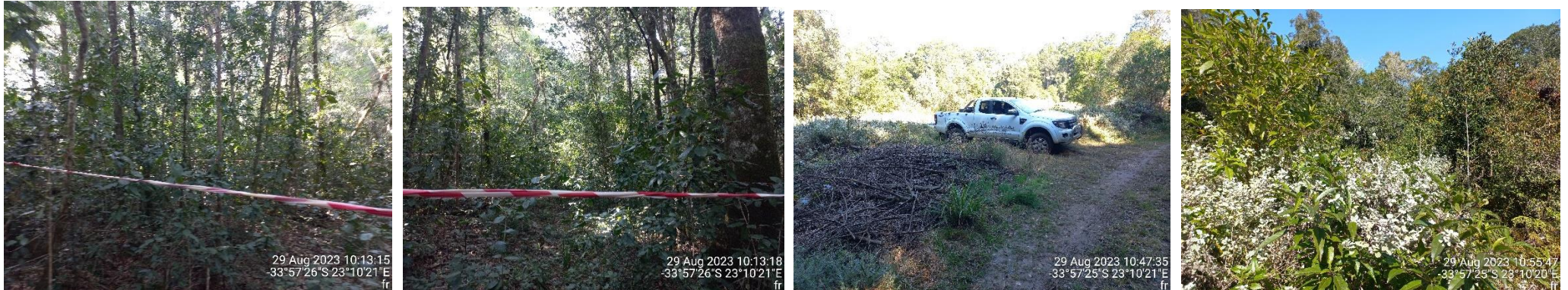
Potential guest tent platform site just within the edge of the Forest fringe.