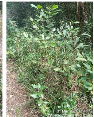
Several tree saplings within track median & shoulders which will require rescue.