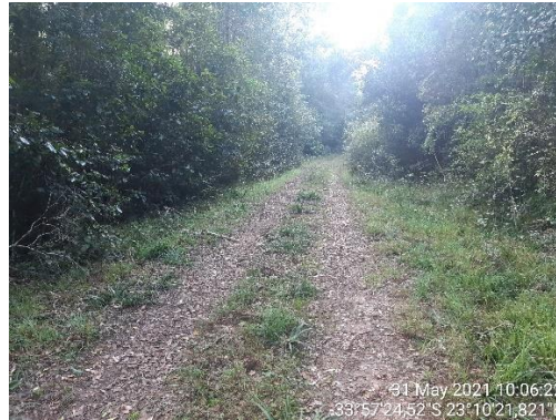
'Ysterhoutrug' track to site.