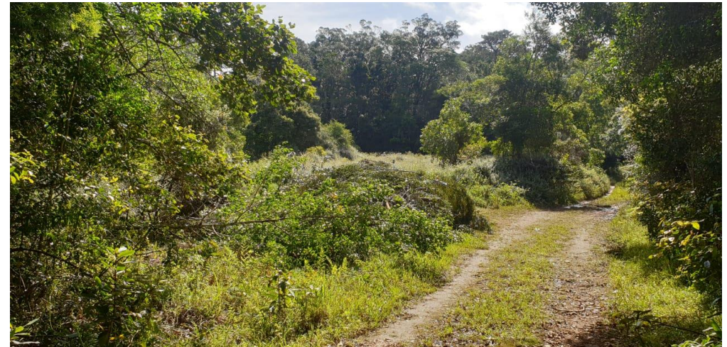
Photos of site clearing clear of alien invasive trees in Nov.2021.