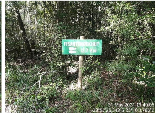
Signage for Outeniqua Trail along access track.