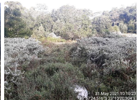
Access track / road below existing of clearing of site. Site clearing overgrown with dense stands of Helichrysum sp. , Bramble & ferns. Several tree clumps to be avoided.