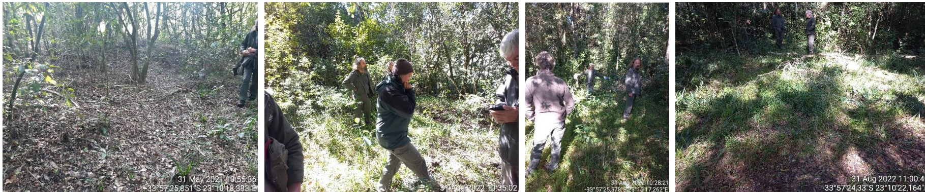
Existing gaps / clearing among trees if Forst fridge, earmarked as potential locations for guest tent platforms. Exact location & orientation of platforms to be guided by SANParks during construction.