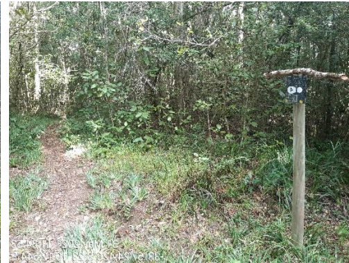
Outeniqua Trail crosses access track.