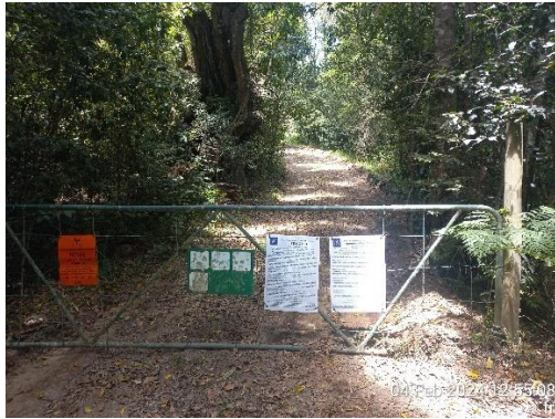
Entrance to 'Ysterhoutrug Road' off R339.