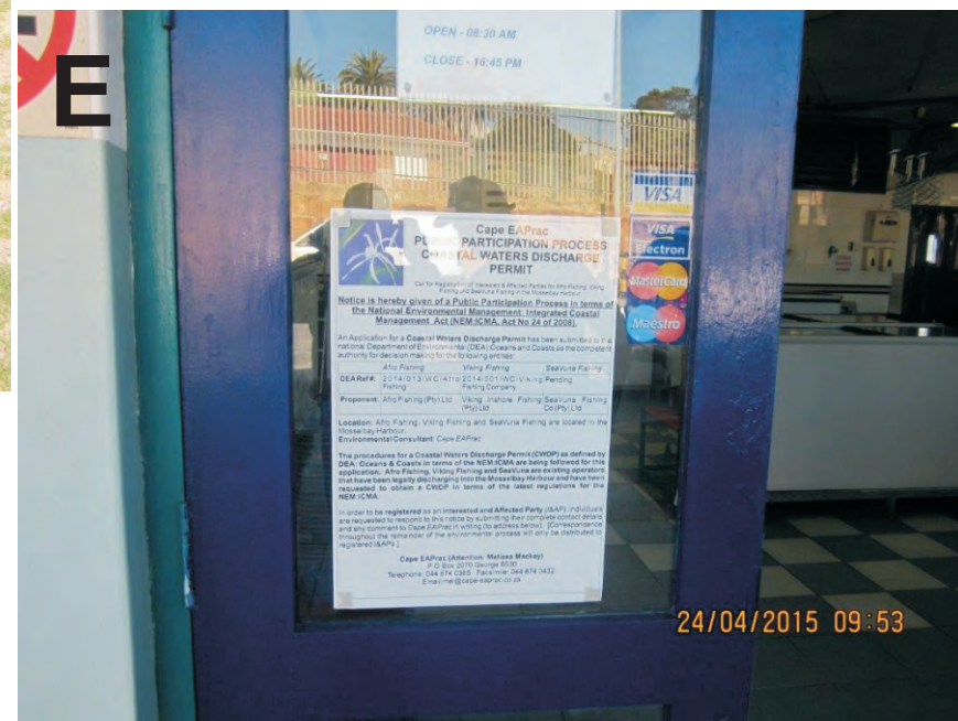
Photo E & F - Site notice placed in the window at the SeaVuna factory shop.

Photo C & D - Site notice placed at the corner before the TNPA access control that provides entrance to Viking Fishing.