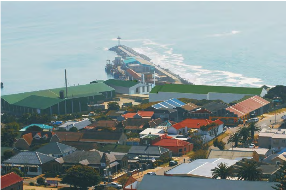
View after re-development