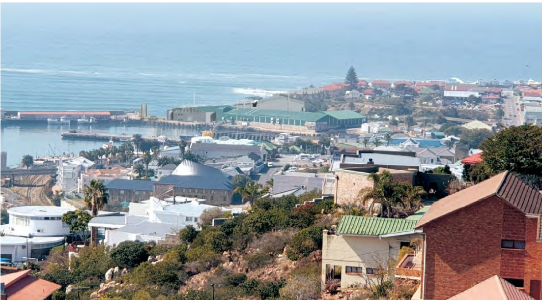
View after re-development