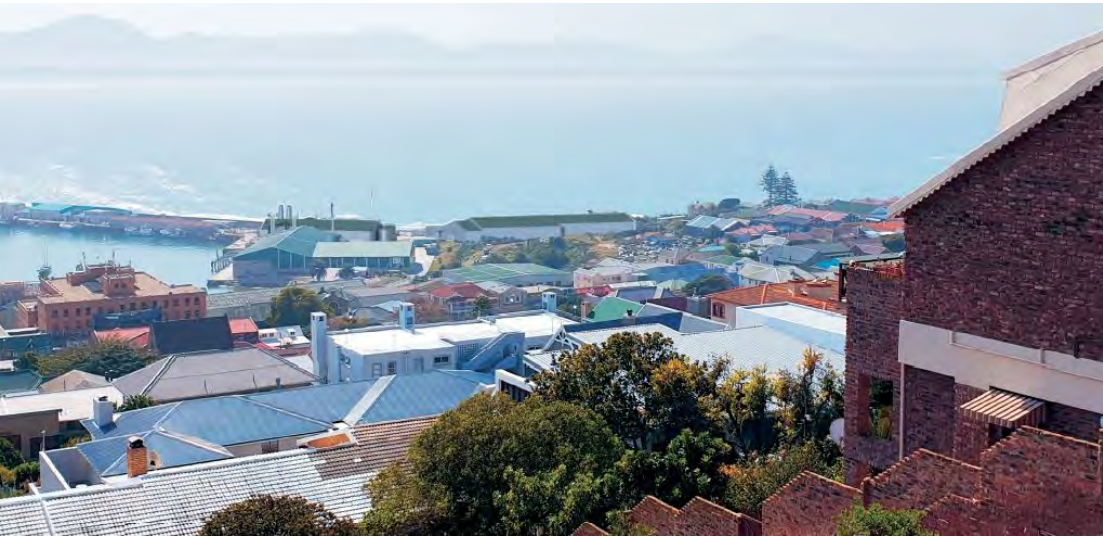
View after re-development