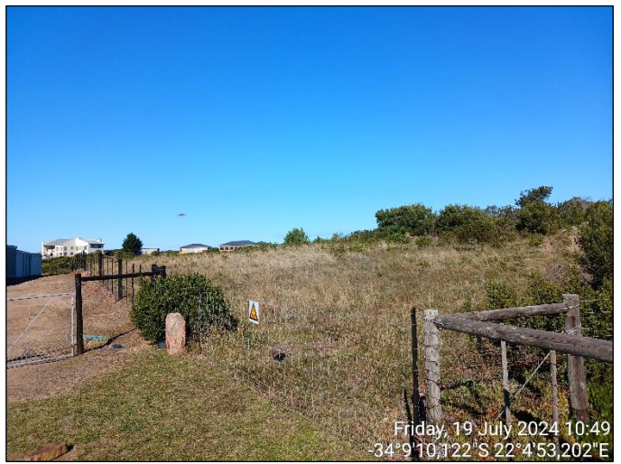
Figure 3: Skilpad Road, Klipheuwel Road and Locality of proposed stormwater pipeline on 208/220.