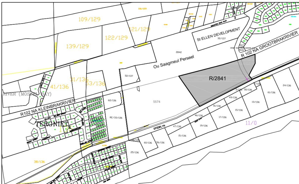
Figure 1: Locality map of proposed development site (grey shaded area) on Remainder of Erf 2841, Tergniet, Mossel Bay (Formaplan, 2024).

Cape EAPrac has been appointed as independent environmental consultants responsible for facilitating the environmental investigation and formal Basic Assessment process for the proposed residential development on the Remainder of Erf 2841 and Erf 5574, Tergniet, Mossel Bay Municipality (Figure 1).