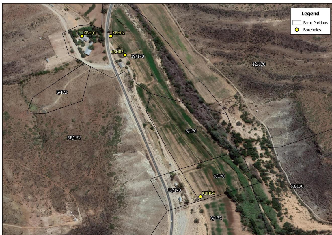
Figure 1: Map showing location of boreholes.

The location of each borehole is indicated in Figure 1. Boreholes KBH02 and KBH03 are two new boreholes. Boreholes are located on Portion 9 and 19 of Farm 170 Gamtoosberg, both of which are included in title deed T3542/2020.