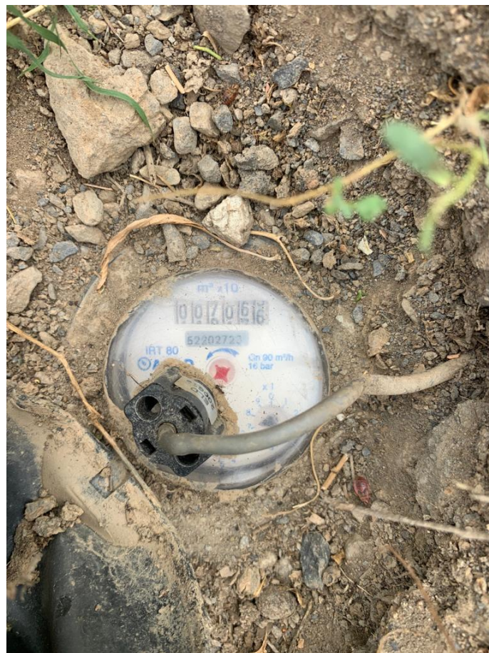
Figure 2: KBH02