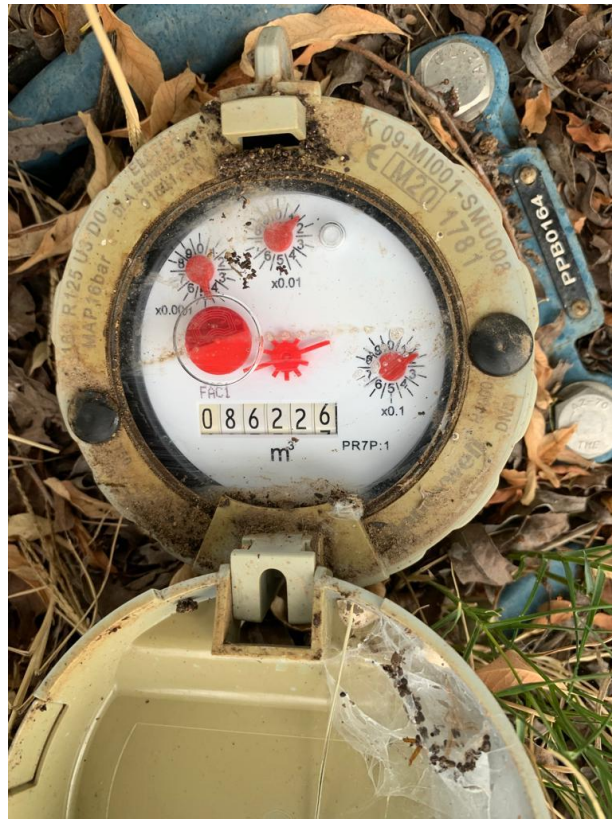
Figure 3: KBH03