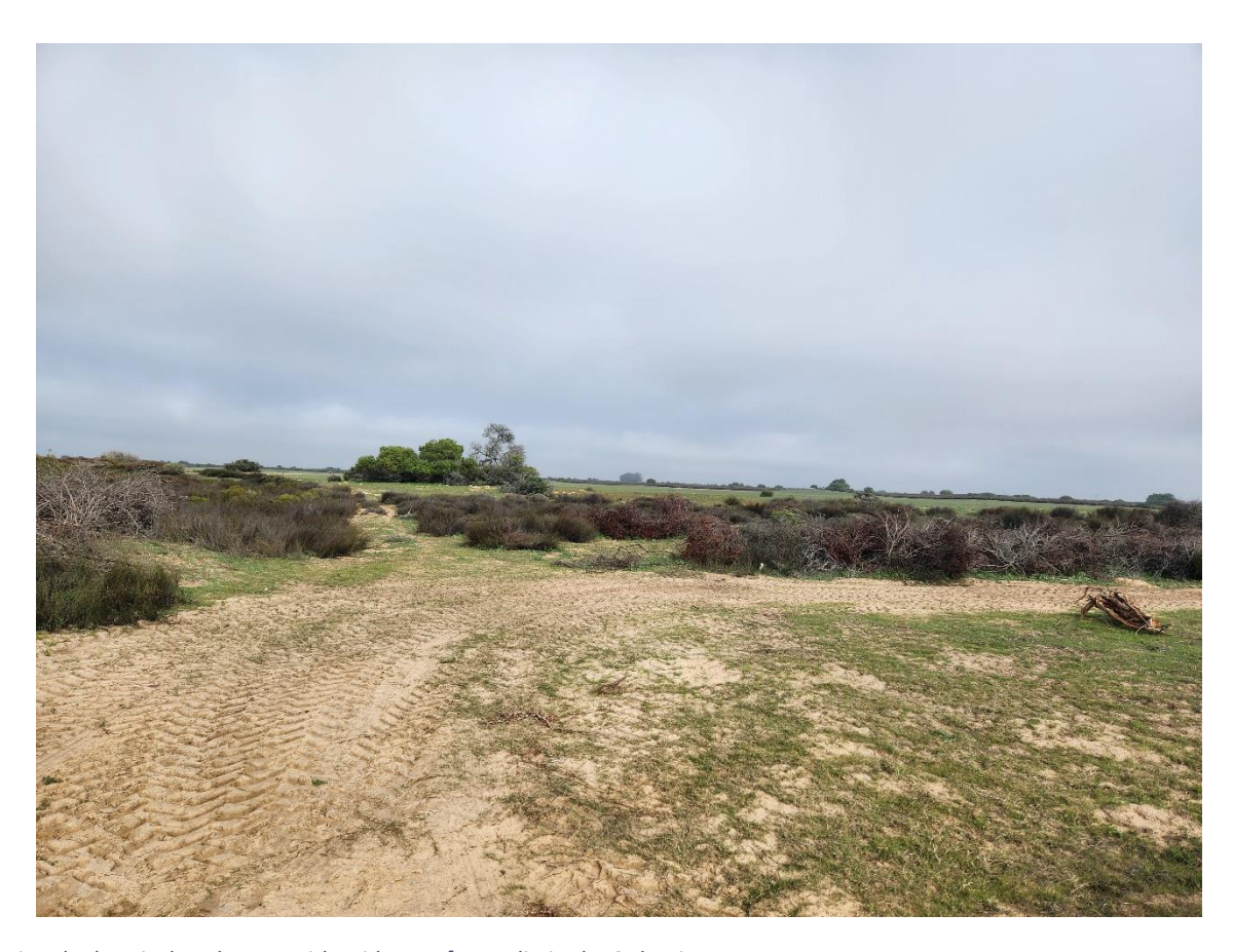
Figure 3: Disturbed Agricultural Areas with evidence of some limited AIS clearing