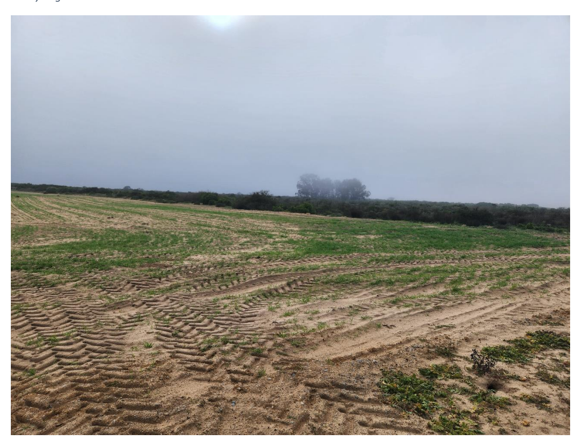
Figure 8: Agriculturally Transformed Areas