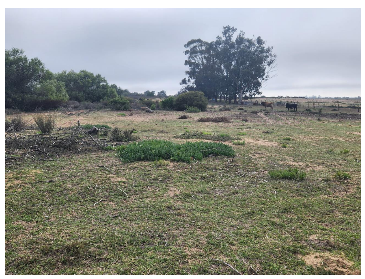
Figure 4: Disturbed Agricultural Areas with Invasive Alien Vegetation Present