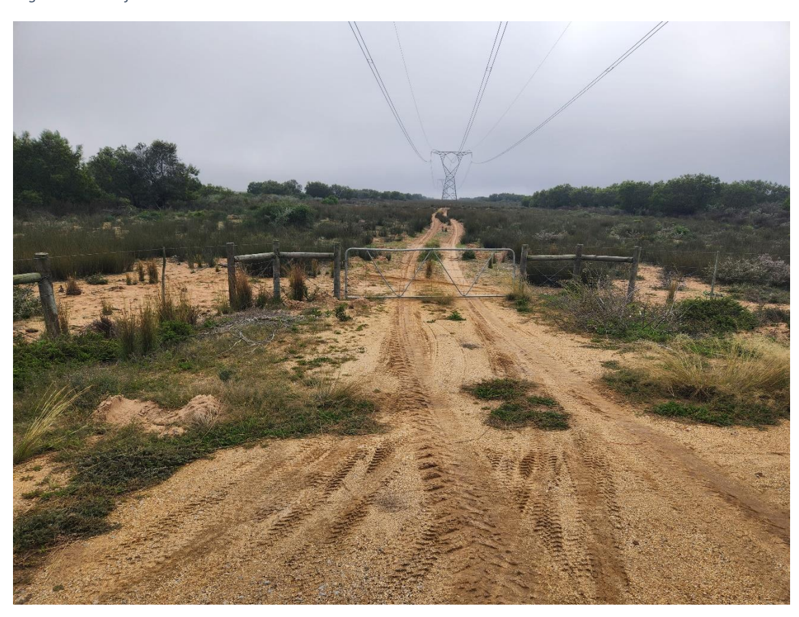
Figure 6: Aurora - Juno 400Kv Powerline crossing the Property