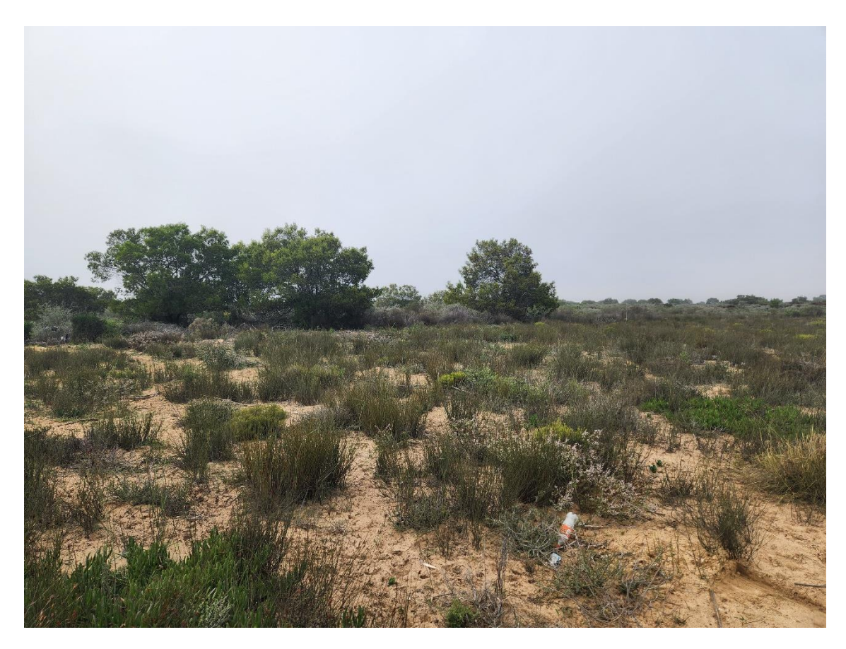
Figure 7: Secondary Vegetation with scattered AIS