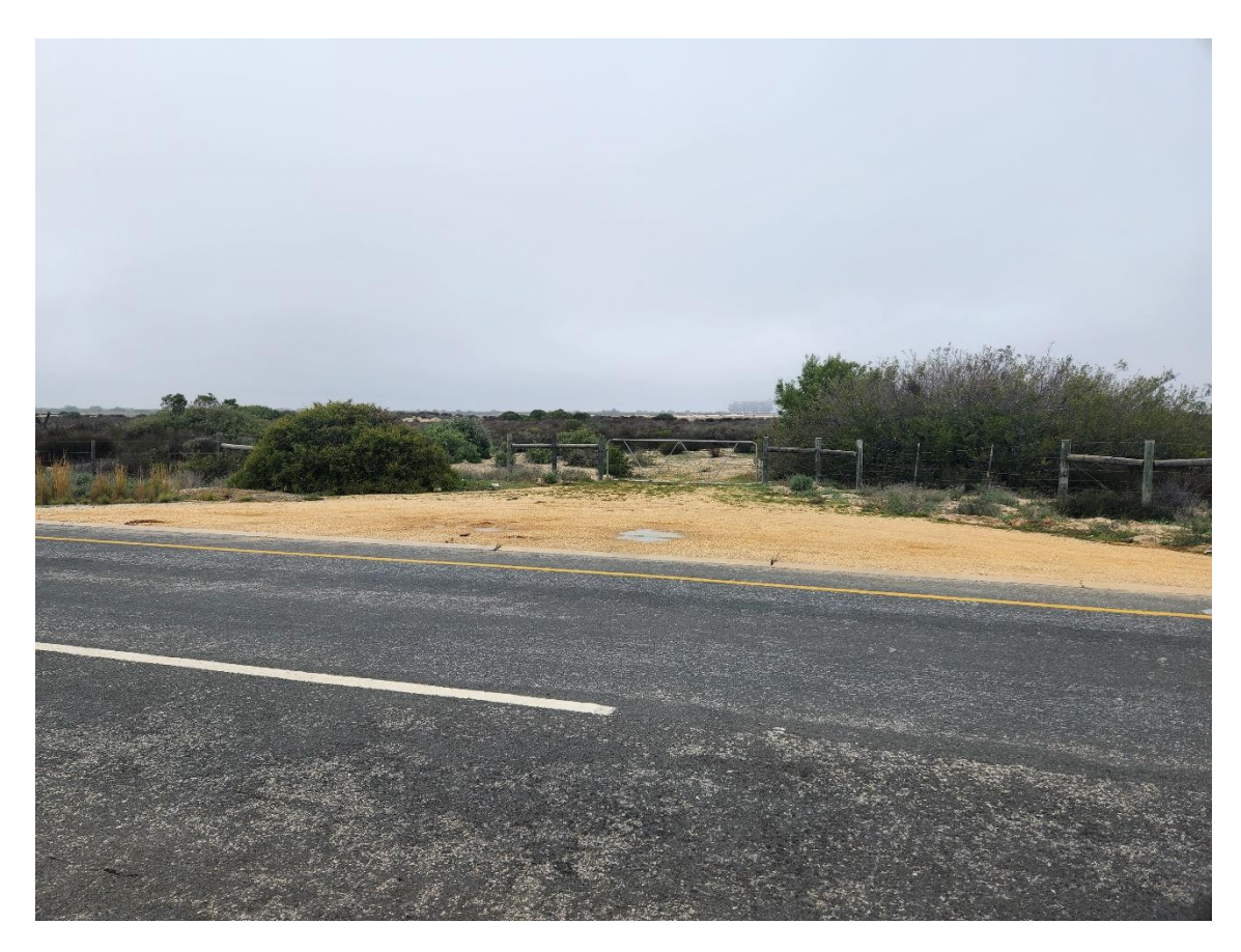
Figure 5: Existing Access Point from the R399