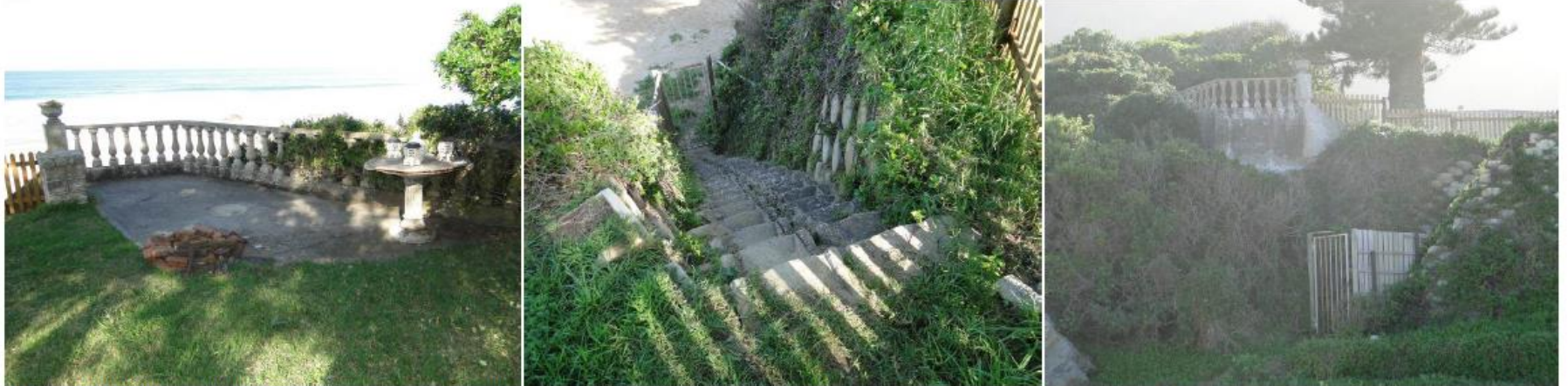
Photos 12, 13, 14 (left-to-right): Remaining section of former historic boundary wall to southern boundary; Modern stairway leading to the beach; North-facing view from the beach showing remnant of former boundary wall on top of historic retention wall (to left) as well as modern retention wall to the right.