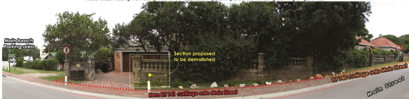
Photo 2: North-facing street elevation along Main Street illustrating section of historic stonewalling proposed to be demolished.