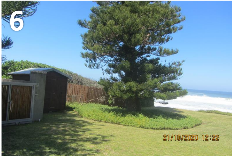
Photo 6: view across the grassed lawn to the Norfolk Island pine on the eastern boundary. Photo 7: across the grassed lawn to the sea.