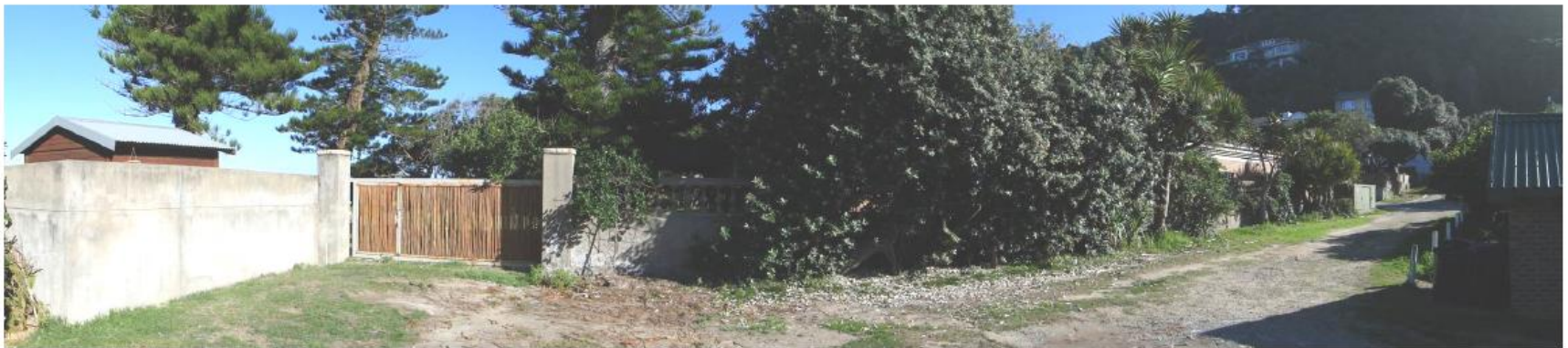
Photo 10: West-facing view of eastern site boundary as viewed from Read Street. Existing secondary site entrance/ present entrance to Erf 390 to left of this image.