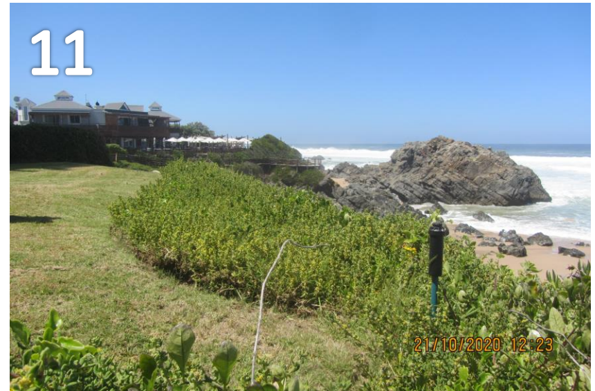
Photo 10: View of the picnic area on the south western boundary. Photo 11: View across the top of the retaining wall. Photo 12: View of the erven from the south eastern boundary, showing the extent of the garden. Photo 13: View of the existing dwelling from the south eastern corner.