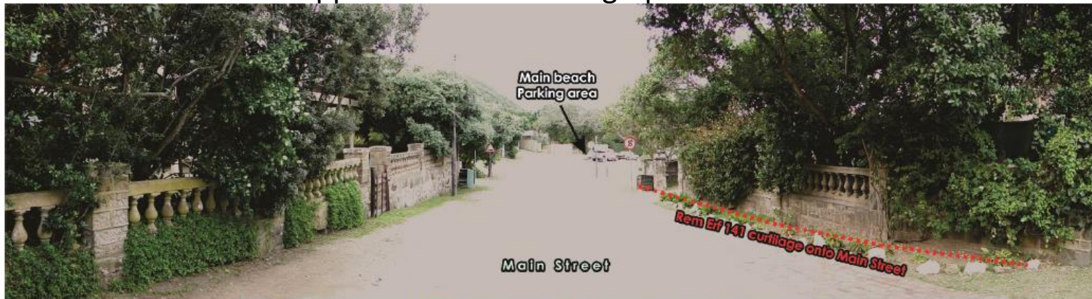
Photo 1: East-facing view along Main Street approaching parking area. Stonewalling defining a "gateway"