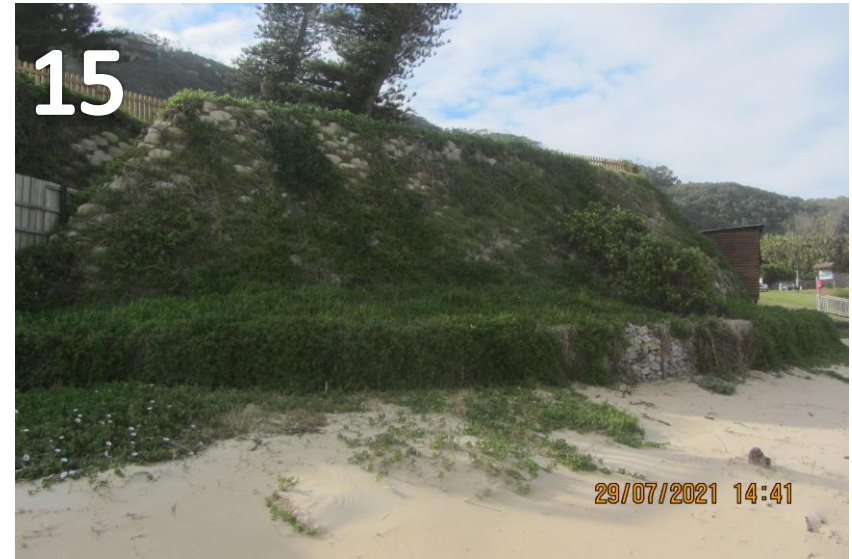
Photo 14: View of the retaining wall from the foot of the stairs. Photo 15: Extent of the retaining wall with the existing rock gabion at the foot. Photo 16: View of the property from the beach showing the gate on the left with the retaining wall and gabion in the front. Photo 17: View of the rock gabion wall to which the new proposed rock gabion will connect on to.