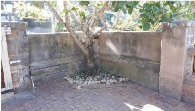
Photo 4: NE corner of the site defining the corner of Main and Read Streets.