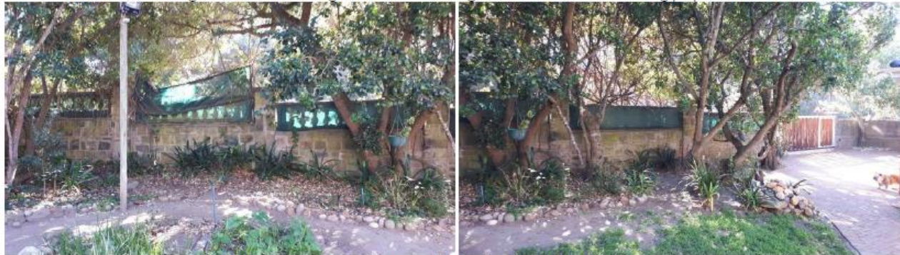
Photo 3: Street-facing sandstone walling as view from inside the site boundary.