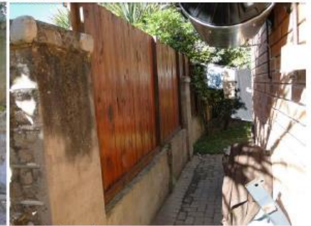
Photos 6-9 (left-to-right): Showing generally dilapidated state of less elaborate historic stonewall presently defining the eastern site boundary.