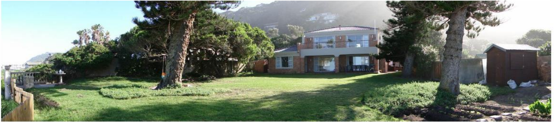
Photo 11: Northwest-facing panoramic view of site showing existing modern house, small section of remaining stonewall to far left of this image. Norfolk pines evident in the foreground.