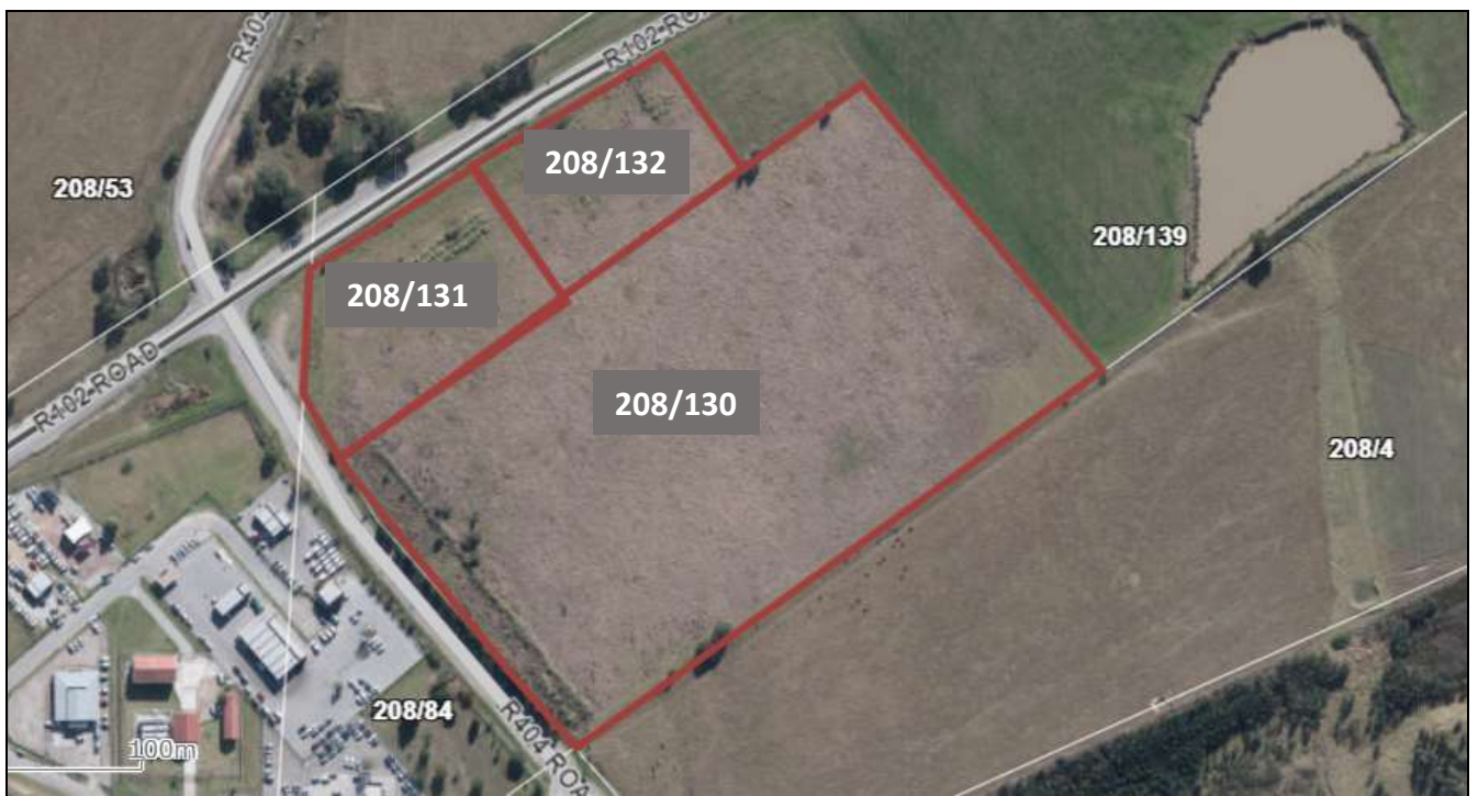
Figure 1: The subject properties (indicated in red) together with the immediate surrounding land uses.

Gwayang 208/130, 131 & 132, George, hereafter referred to as the subject properties, are situated to the west of George. The subject properties are directly east of the R404, directly opposite the George Airport entrance. The subject properties are not situated within the urban edge, but is inside the Airport Support Zone edge. The properties are shown in the figure below.