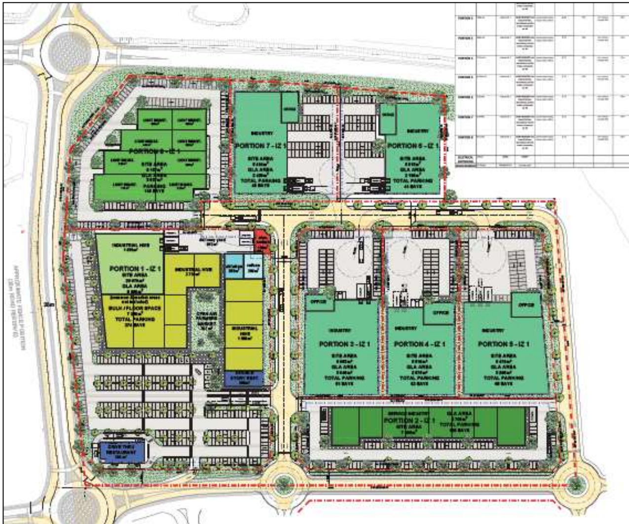
Figure 1: An image of the proposed development on the subject properties.

The image below indicates the proposed development.