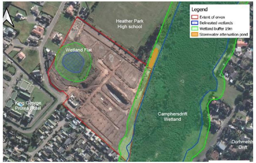
Figure 2: Study site under construction with overlay of wetland areas identified by specialists (Confluent Consulting, 2022).

Subsequent instructions from the Provincial Department of Environmental Affairs & Development Planning (DEA&DP), as well as the Breede-Gourits Management Catchment Agency (BGCMA) aiding Department of Water Affairs, resulted in Power Group (Pty) Ltd halting construction activities in August 2021.