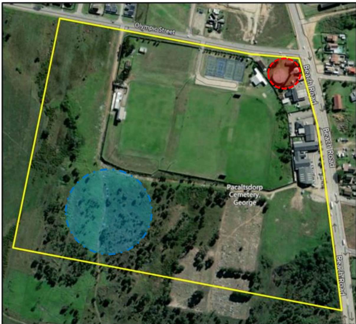
Figure 2: Locality map of proposed development site located south of the Pacaltsdorp sport fields (blue circle) with the existing reservoir/pressure tower indicated by the red circle on the corner of Beach Road and Olympic Street (CapeFarmMapper, 2023).

There is an existing municipal water reservoir (3ML capacity), pump station and water pressure tower (0.34ML capacity) located outside the study area on the north-eastern corner of the Pacaltsdorp sport fields, at the intersection of Olympic Street and Beach Road. The proposed water supply infrastructure will supplement these as part of the greater Municipal water supply network.