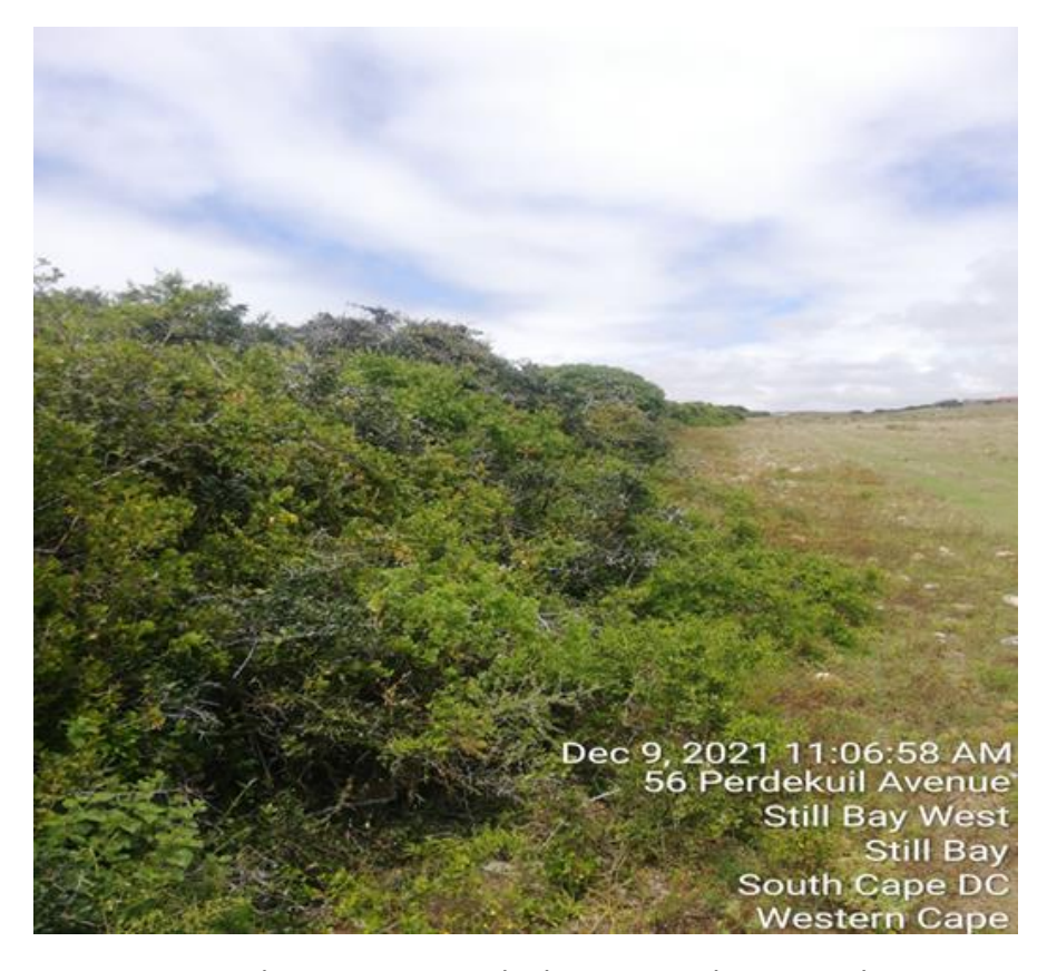
Figure 4: Indigenous Forest thicket encroaching into the site.