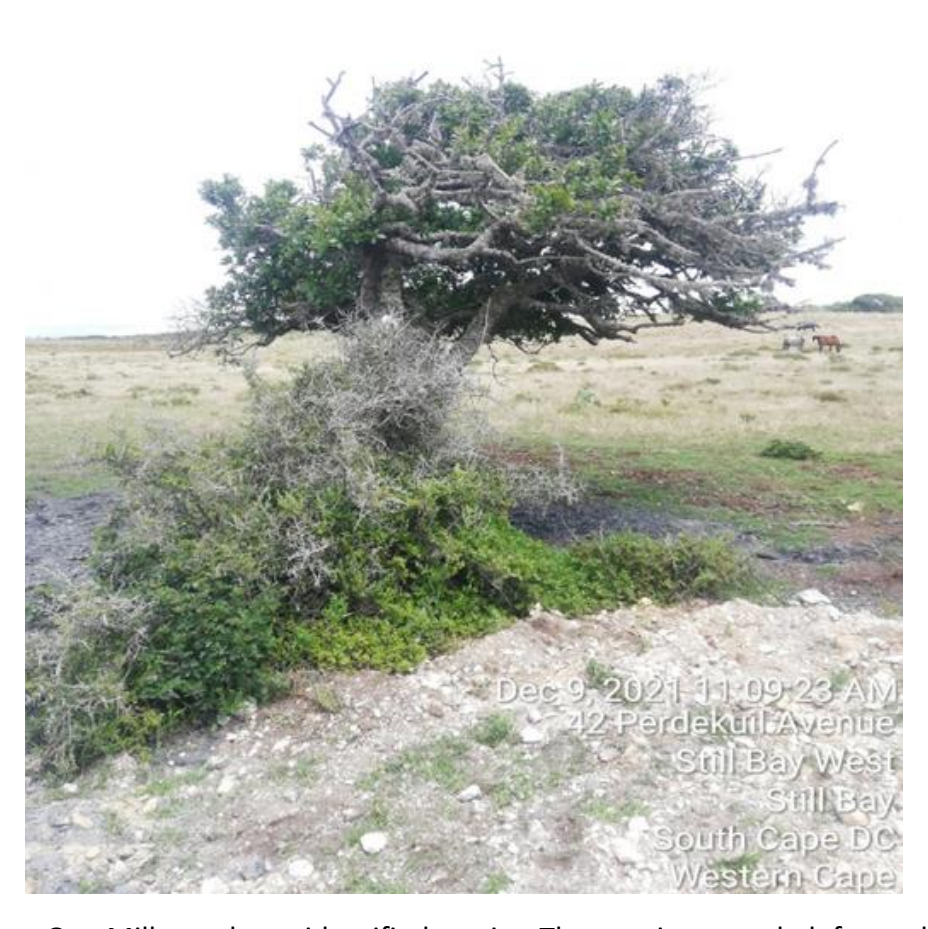
Figure 3: There was One Milkwood tree identified on site. The tree is stunted, deformed and not of good form.