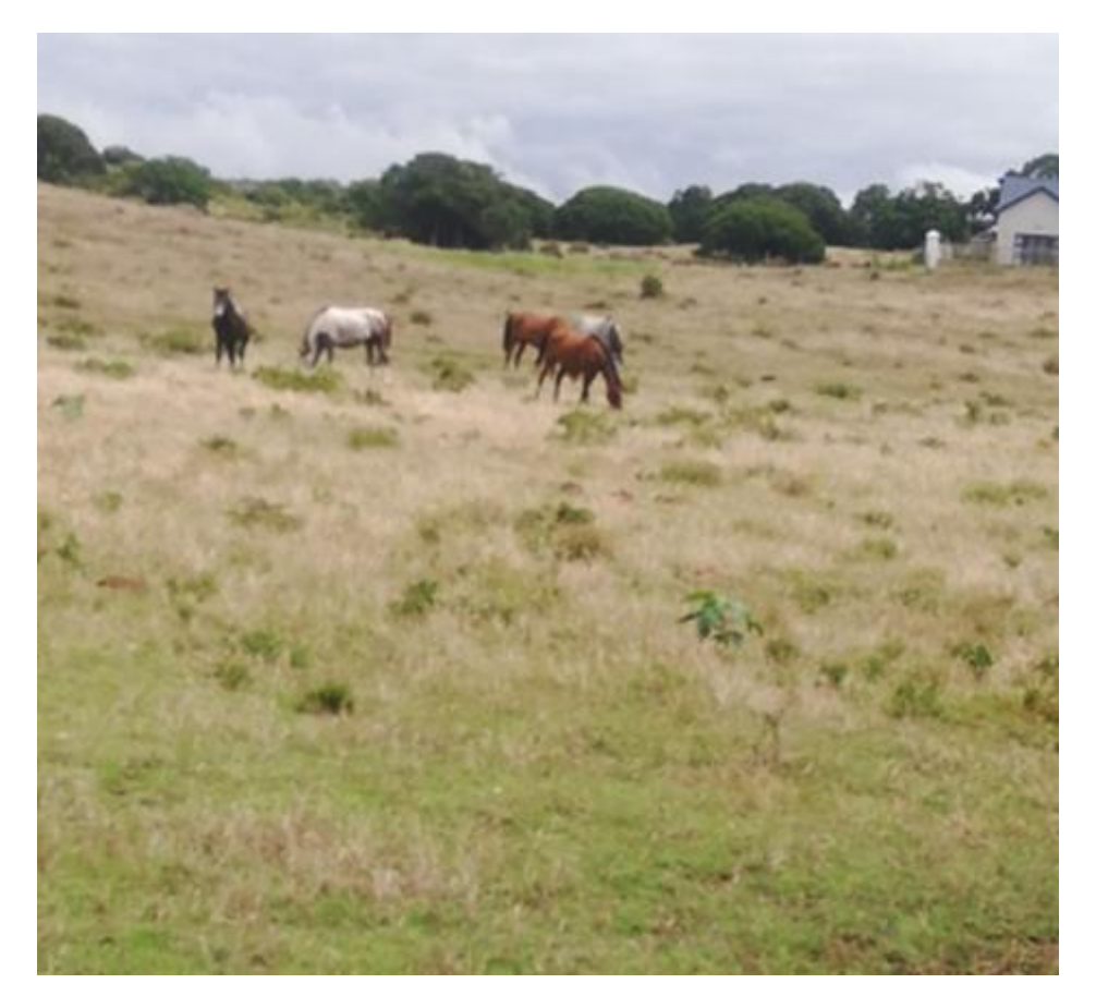
Figure 5: Horse grazing on site.