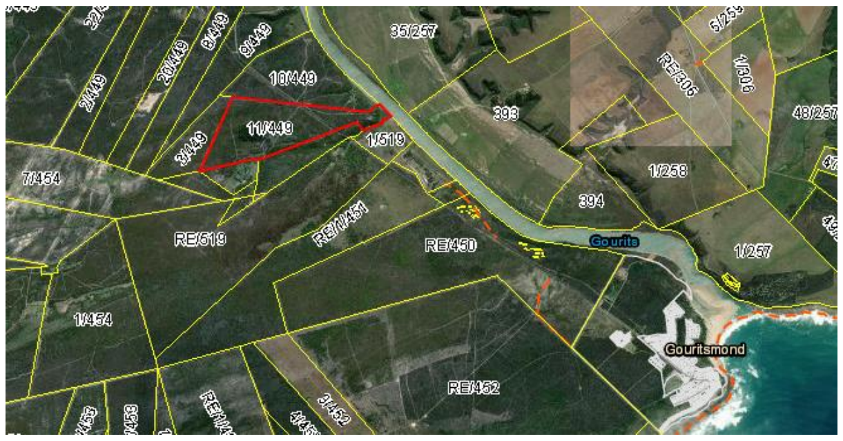
Figure 1: Locality

The property is situated north-west of Gouritsmond with a small portion on the river and most of the farm west of the road to Gouritsmond.