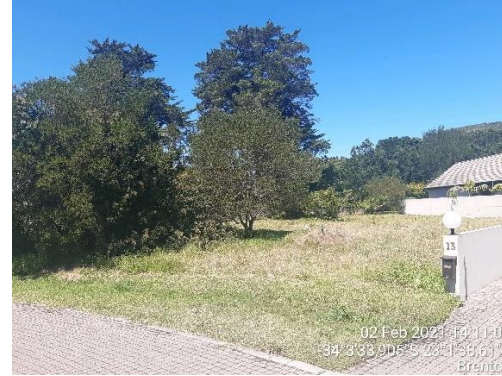
Proposed driveway onto Erf 729.