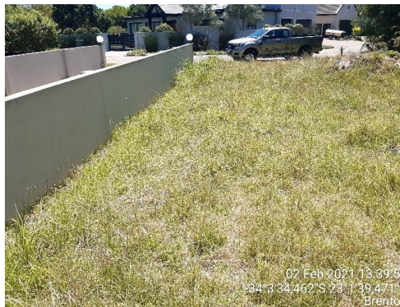
One or two Watsonia sp. individuals noted growing in Kikuyu grass.