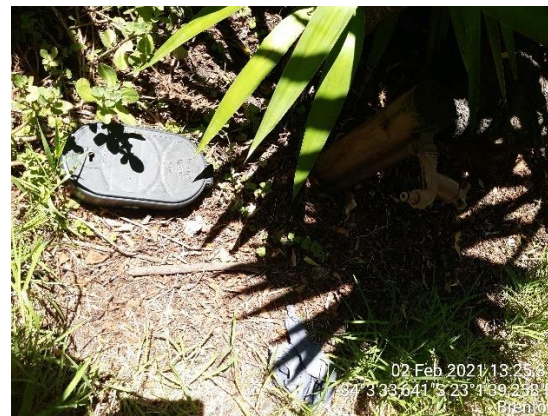
Water connection point for Erf 729 on NW corner of erf.