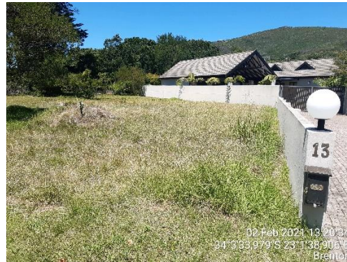
Erf located at 11 Candleberry Drive.