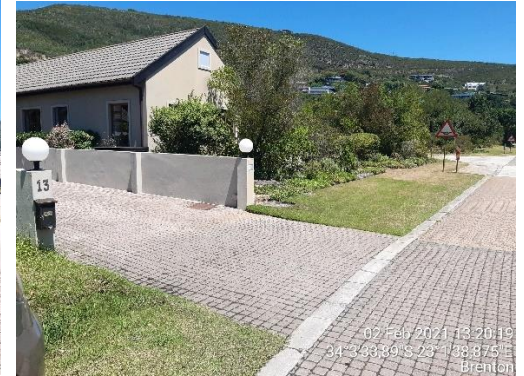
View SW onto neighbouring Erf 728, 13 Candleberry Drive.