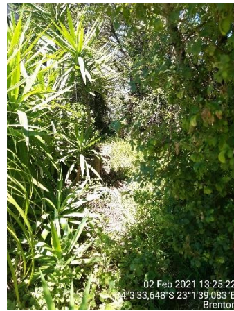
View east along northern erf boundary.