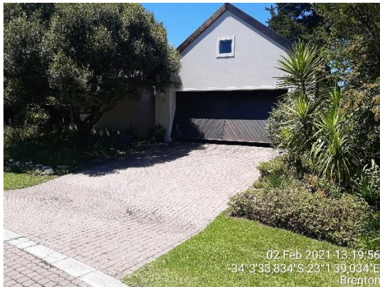
Erf 730, 09 Candleberry Dr. – northern Neighbour of Erf 729.