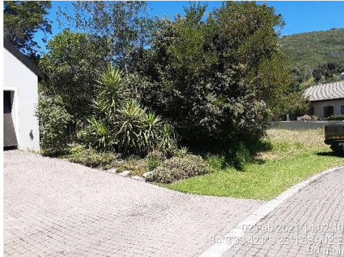
View SE from NW corner of Erf 729. Driveway of Erf 730, 09 Candleberry Dr.