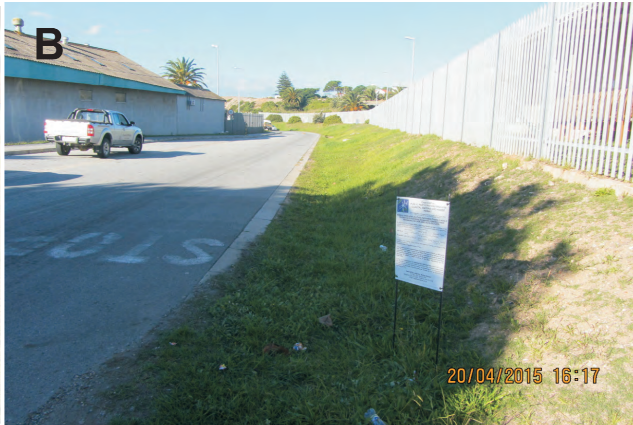
Photo A & B - Site notice placed at the entrance road to Afr Fishing. Photo C & D - Site notice placed at the corner before the TNPA access control that provides entrance to Viking Fishing. Photo E & F - Site notice placed in the window at the SeaVuna factory shop.