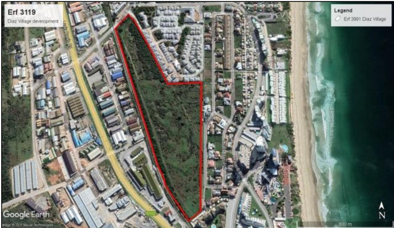
Figure 2: Aerial image of the site and surrounding areas.