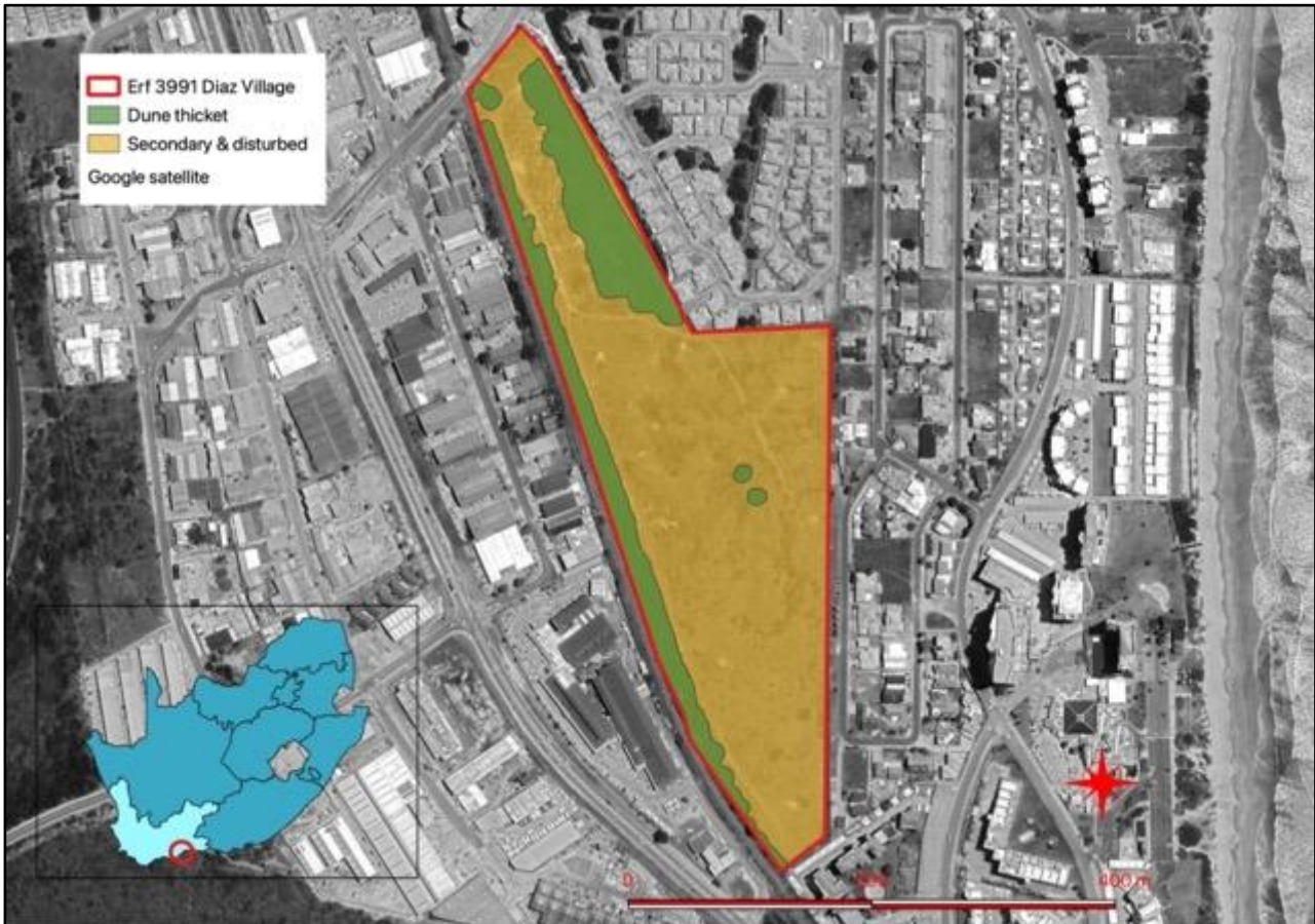
Figure 9: Map of habitats on site.

Based on a detailed field survey to verify conditions on site, it was determined that, with the exception of some bands of dune thicket, only secondary habitat remains on site (Figure 9). A series of photographs are provided below that give various views on site (Figures 10 - 13). The habitat assessment is important for understanding the suitability of habitat on site for various plant species of concern, which usually have very specific habitat requirements.