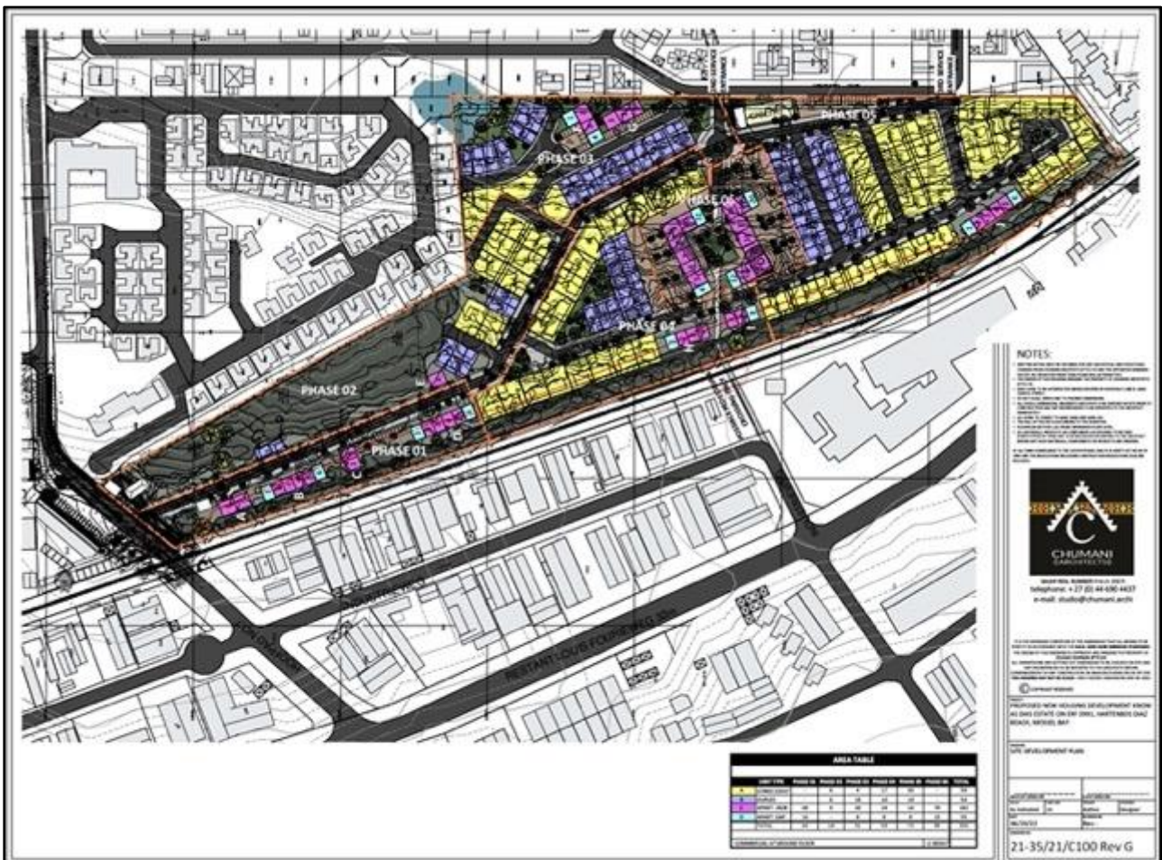
Figure 4: Proposed development.

The proposal is to develop the site for residential purposes. This will include stands for free-standing houses, duplexes, and apartments (Figure 4). Anticipated impacts will mostly occur during the construction phase. These impacts are not expected to extend beyond the boundaries of the study area. The PAOI is therefore treated here as the development footprint within which direct impacts will occur (Figure 4).