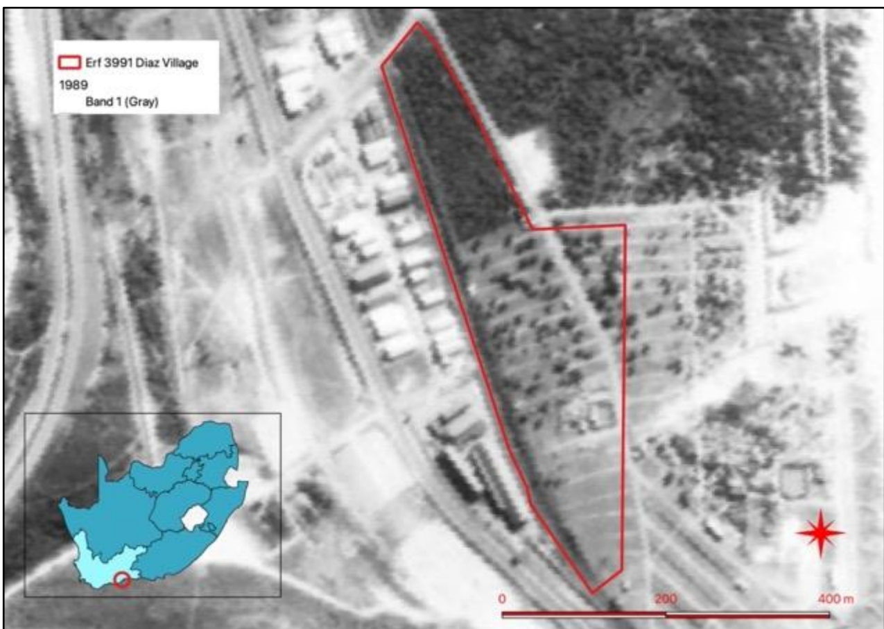
Figure 8: Historical aerial photo of the site, dated 6 June 1989.

A 1957 aerial photograph shows the entire site to be in a natural state at that date. By 1974 this had changed and clearing occurred in the southern two-thirds of the site. A 1989 aerial photograph of the site (Figure 8) shows that the southern two-thirds of the site were cleared, but that the northern section was still natural. By 1991, an additional strip was cleared into the northern section, leaving the pattern that is currently in place. The patterns of clearing on site appear to be related to the general development of the surrounding areas.