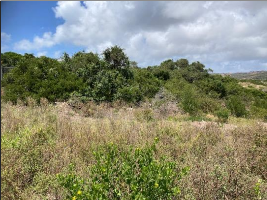
Figure 11: Mixed thicket in northern part of site.