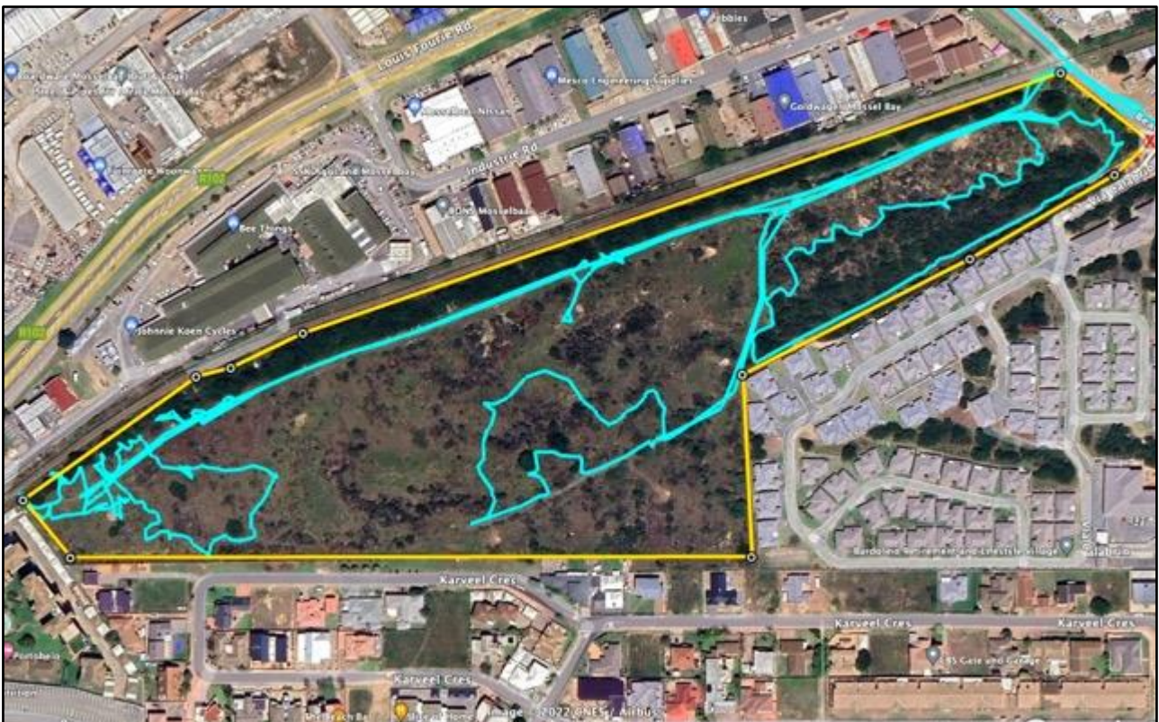
Figure 7: GPS track log of areas walked in the course of undertaking this assessment.

Aerial imagery from Google Earth was used to identify and assess habitats on site. This included historical imagery that may show information not visible in any single dated image. Patterns identified from satellite imagery were verified on the ground. Digital photographs were taken at locations where features of interest were observed. During the field survey, particular attention was paid to ensuring that all habitat variability was covered physically on the ground.