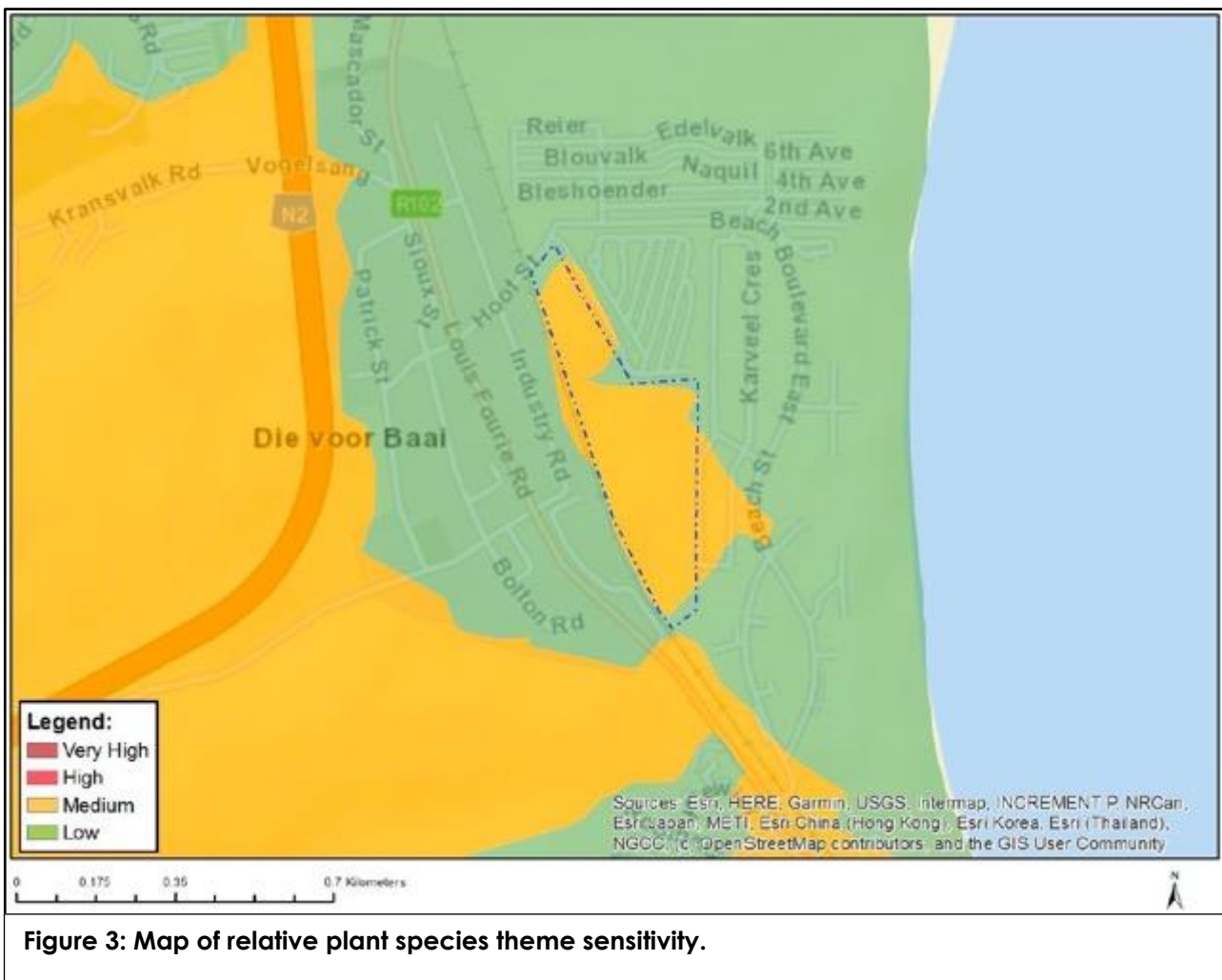
Figure 3: Map of relative plant species theme sensitivity.