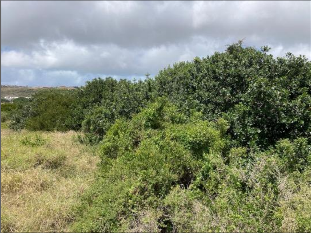
Figure 10: Band of thicket along western boundary.