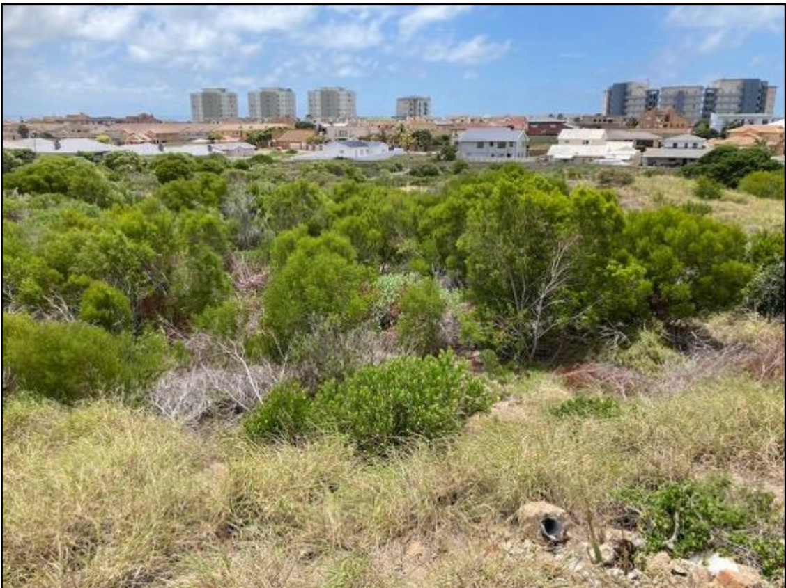
Figure 12: Areas on site dominated by alien invasive Acacia cyclops .