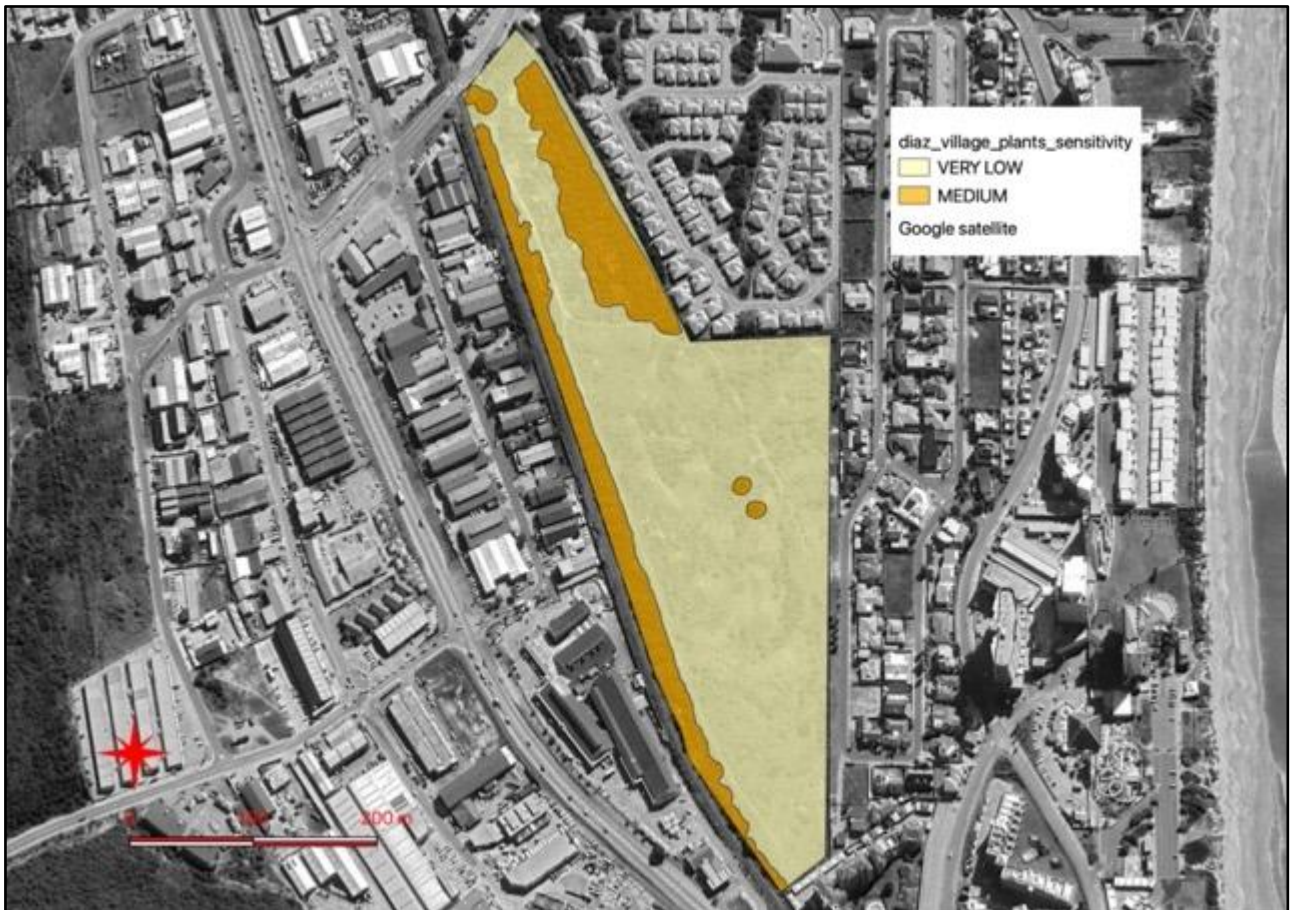
Figure 14: Plant species theme sensitivity for the site.

Based on the "Site Ecological Importance" assessment, the Dune Thicket is mapped as having MEDIUM sensitivity , and other parts of the site as having VERY LOW sensitivity (Figure 18) for the Terrestrial Plant Species Theme.