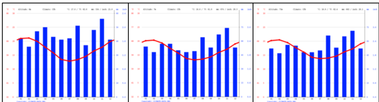
Figure 6: Climate diagrams showing monthly rainfall for Mossel Bay (left), Knysna (centre) and Plettenberg Bay (right).