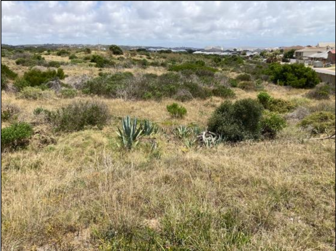
Figure 13: General view of secondary vegetation on site.