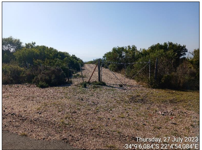
Figure 3: Skilpad Road, Klipheuwel Road and Henning Road to be formalised to link Island View with Klipheuwel Road.