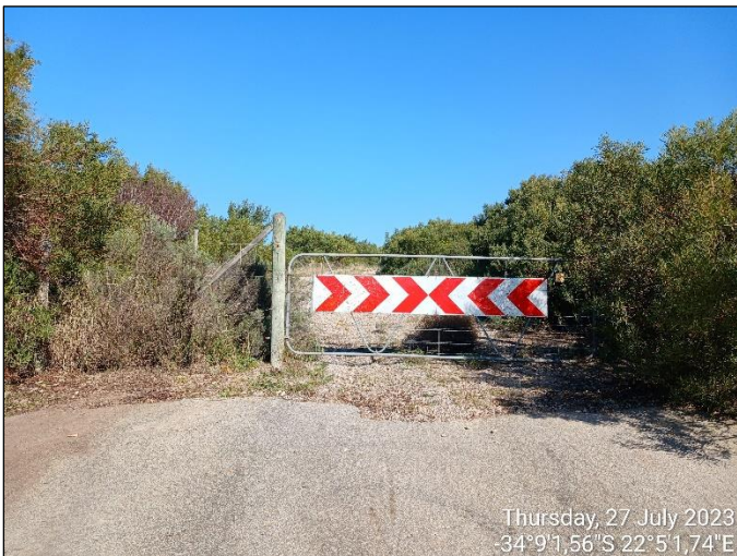
(c) Henning Road, Island View, to be formalised to link with Klipheuwel Road.