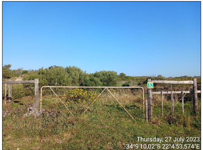
Figure 1: Current entrance to Ptn 209 of Farm 220 Aalwyndal via Klipheuwel Road.