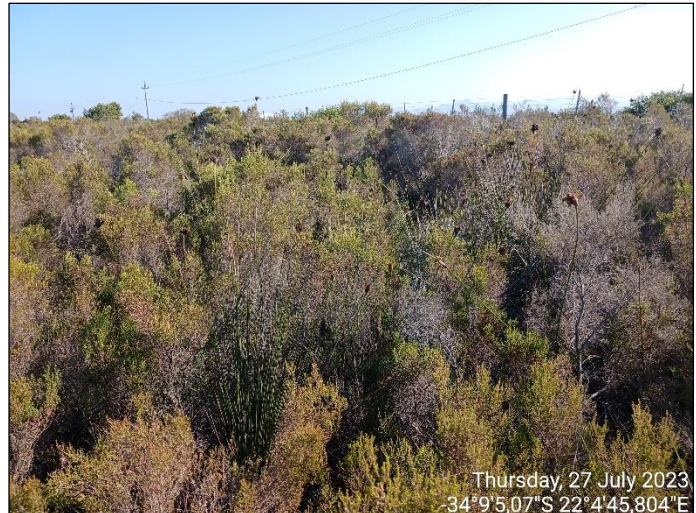
Figure 2: Indigenous vegetation found on site (Fynbos).