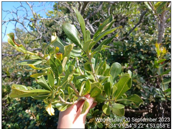
Figure 5: Protected trees found on-site (Milkwood & Cheesewood Tree Species).