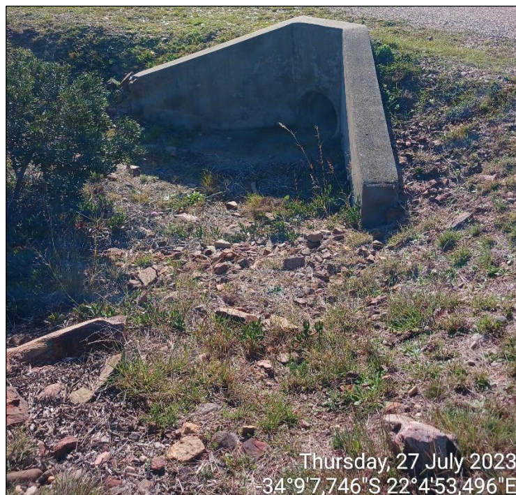
Figure 4: Existing Municipal Culvert adjacent to Ptn 209 of Farm 220, Aalwyndal.