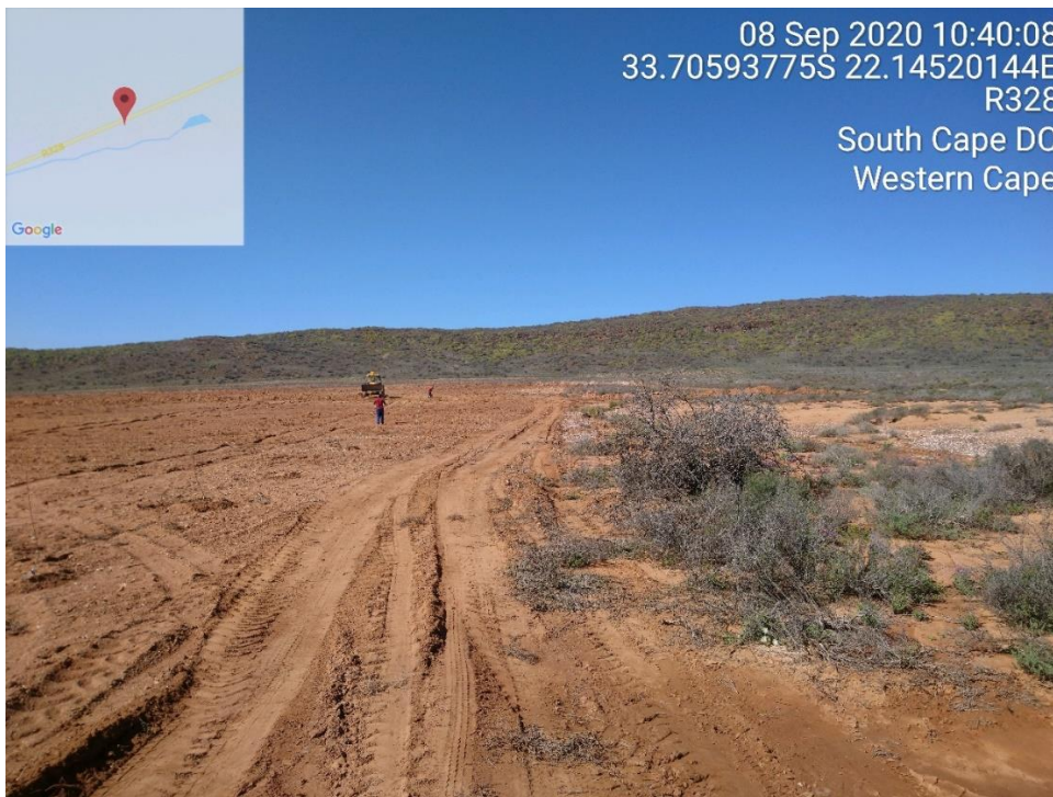
Photograph 2: Area adjacent to the cleared area which had not yet been cleared.