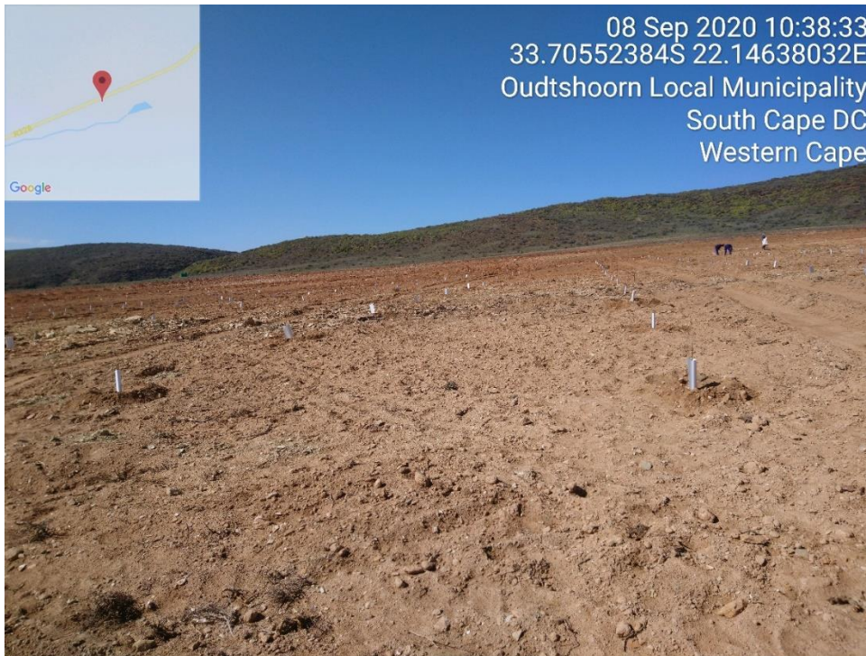
Photograph 1: Cleared area recently planted.