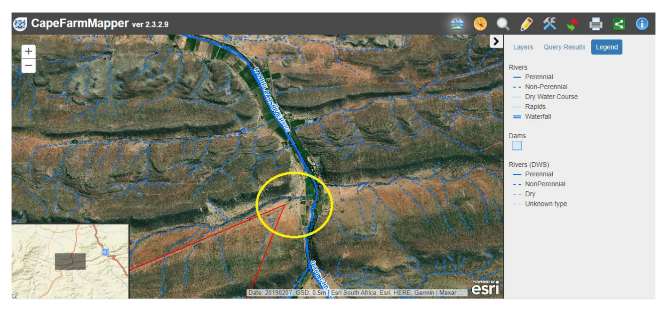
Map 2: The pipeline has been installed more than 32 meters away from the Doring River. However, as depicted in the yellow circle, the pipeline crosses a tributary of the Doring River.