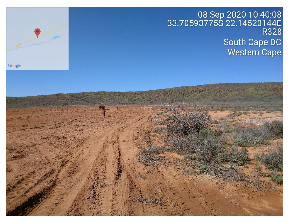
Photograph 2: Area adjacent to the cleared area which had not yet been cleared.